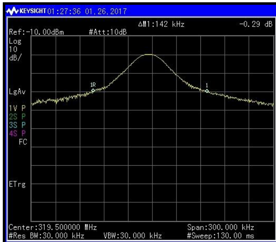
Figure 3: Measured Bandwidth

The plot that follows (made using an Agilent Model N9340B Spectrum Analyzer) shows the bandwidth of the modulated signal is 142 kHz or 0.142 MHz. These measurements show compliance with the bandwidth requirements by a margin of 657 kHz or .657 MHz.