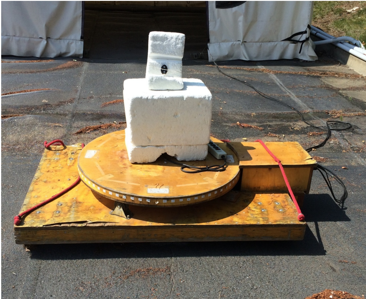
Radiated Emissions (Less Than 1 GHz)