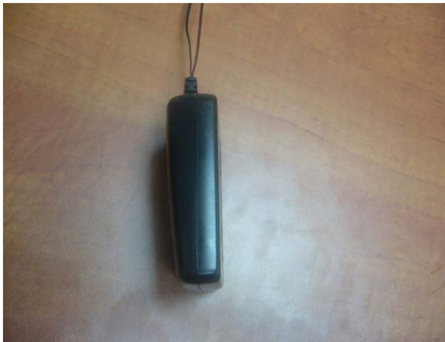
Meter - Side View