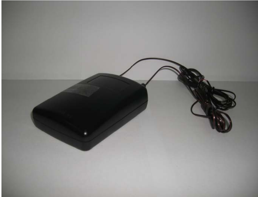
Meter - Overall View