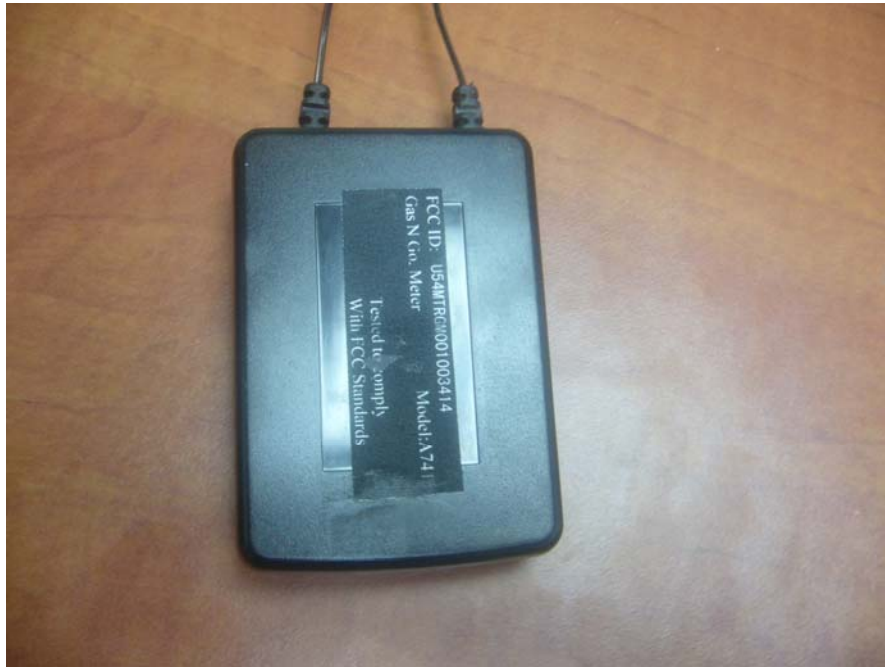
Meter - Back View