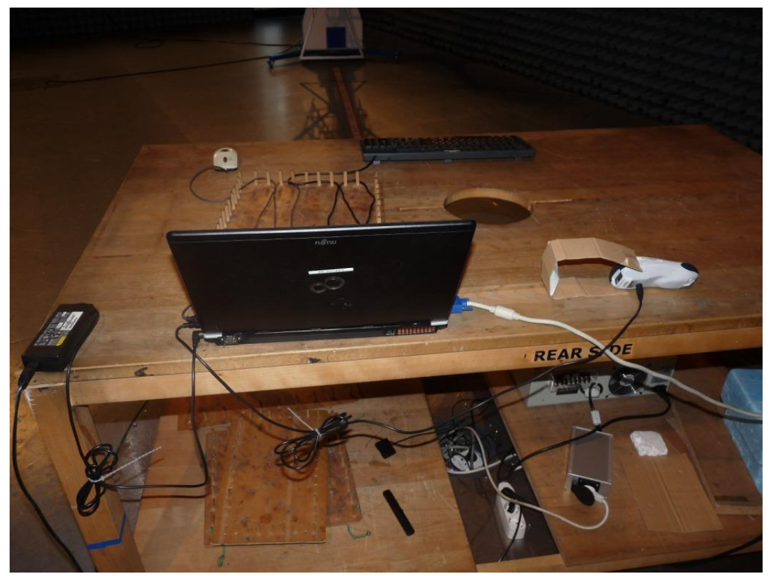
Photo 4: Test setup for radiated measurements, unintentional radiator (15) single device setup, computer peripheral.