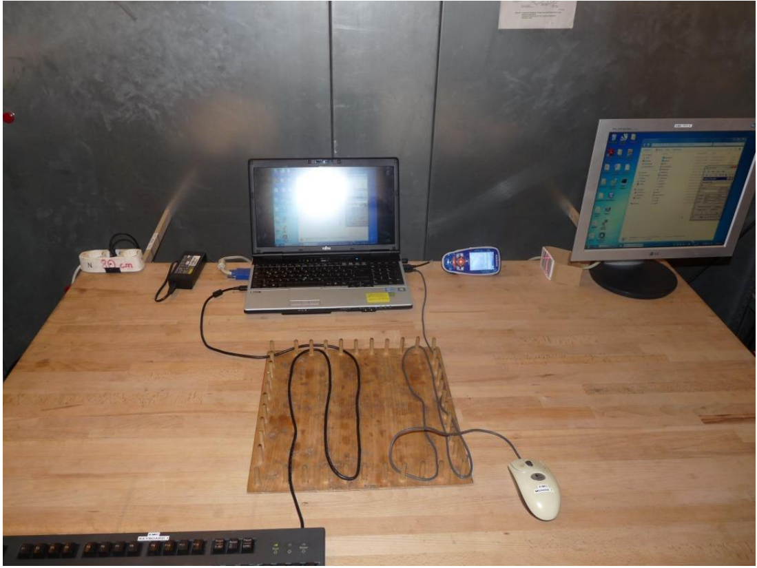
Photo 1: Test setup for conducted measurements unintentional radiator (§15) Single device setup, computer peripheral.