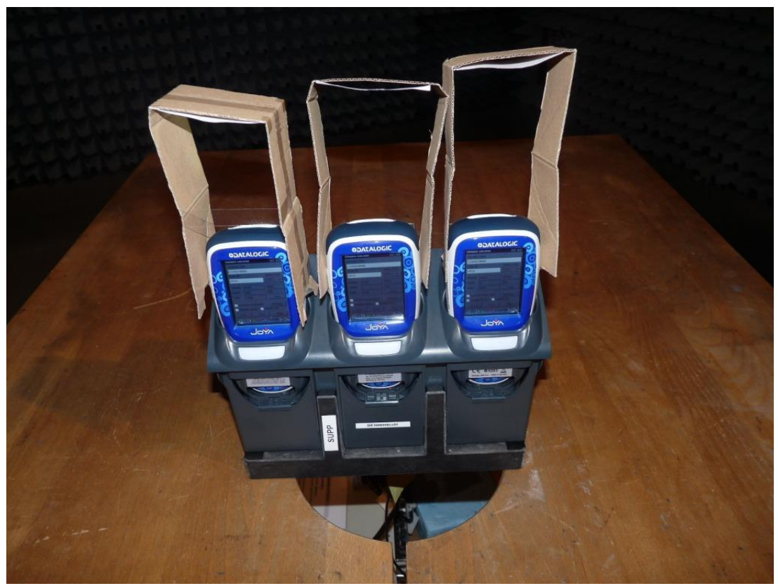
Photo 3: Test setup for radiated measurements, unintentional radiator (§15) 3-slot-cradle setup