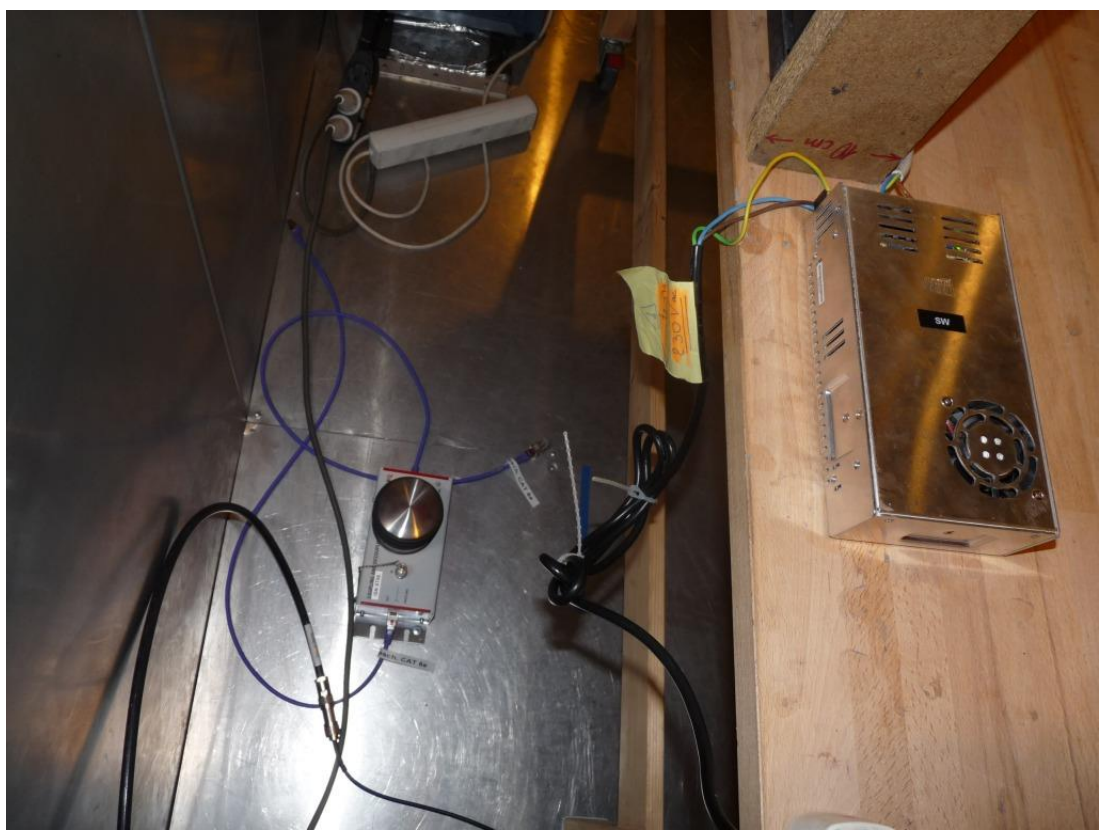
Photo 2: Test setup for conducted measurements, unintentional radiator (§15) 3-slot-cradle setup.