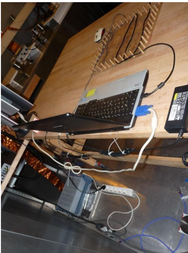
Photo 2: Test setup for conducted measurements, unintentional radiator §15) single device setup, computer peripheral setup.