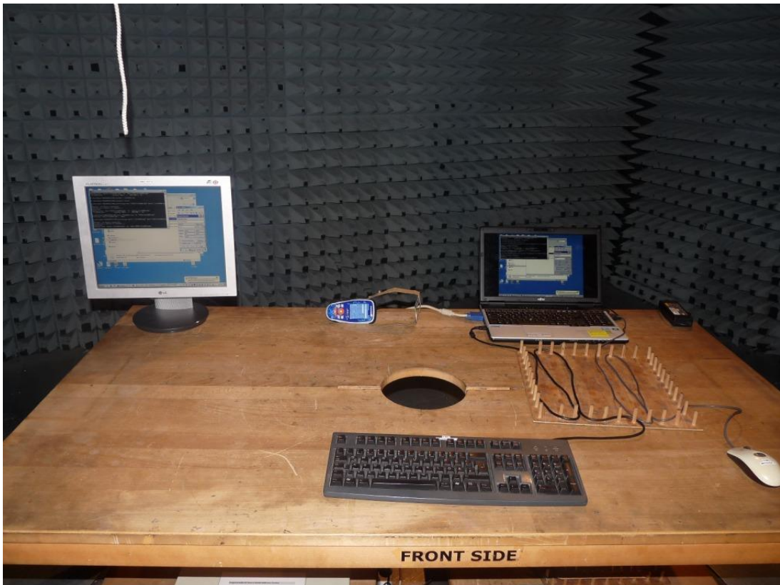
Photo 3: Test setup for radiated measurements, unintentional radiator §15) single device setup, computer peripheral.