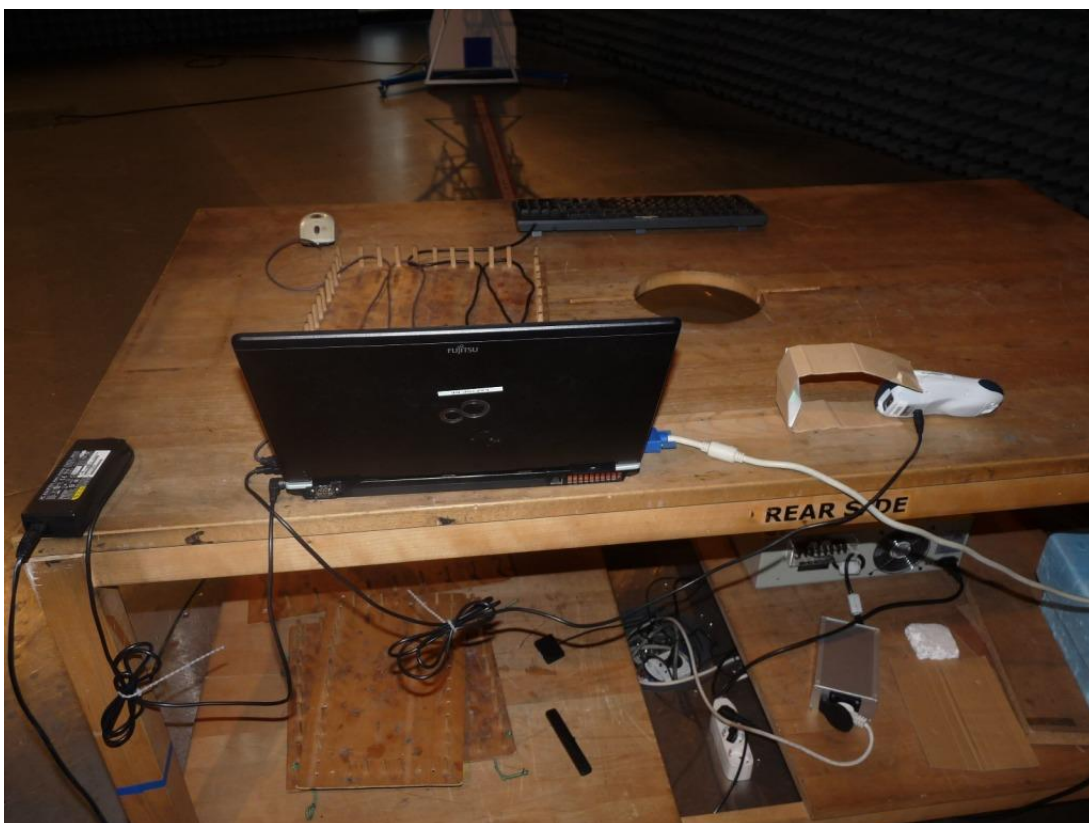
Photo 4: Test setup for radiated measurements, unintentional radiator (15) single device setup, computer peripheral.