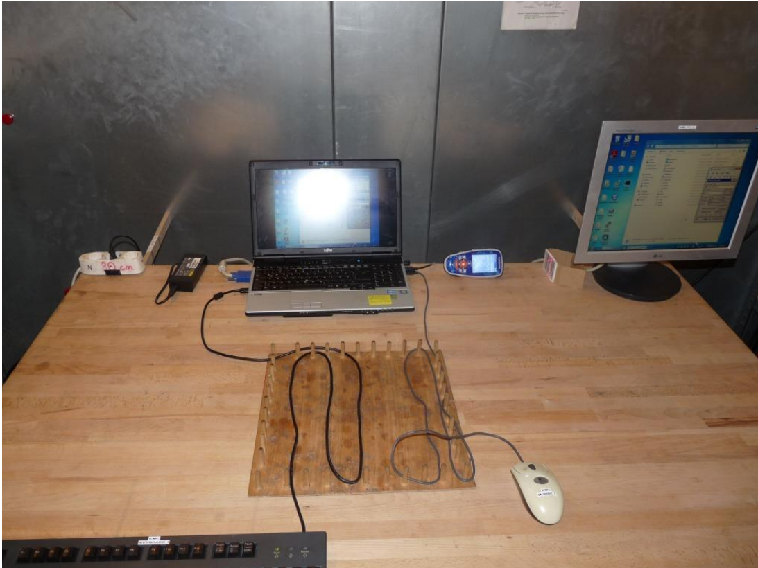
Photo 1: Test setup for conducted measurements unintentional radiator (§15) Single device setup, computer peripheral.