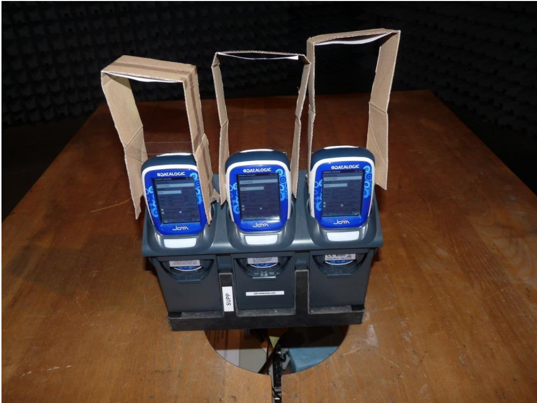
Photo 3: Test setup for radiated measurements, unintentional radiator (§15) 3-slot-cradle setup