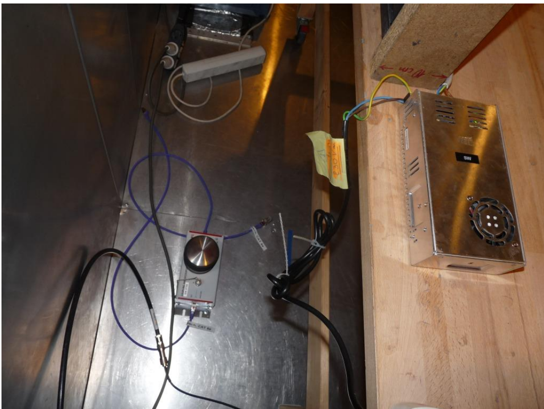
Photo 2: Test setup for conducted measurements, unintentional radiator (§15) 3-slot-cradle setup.