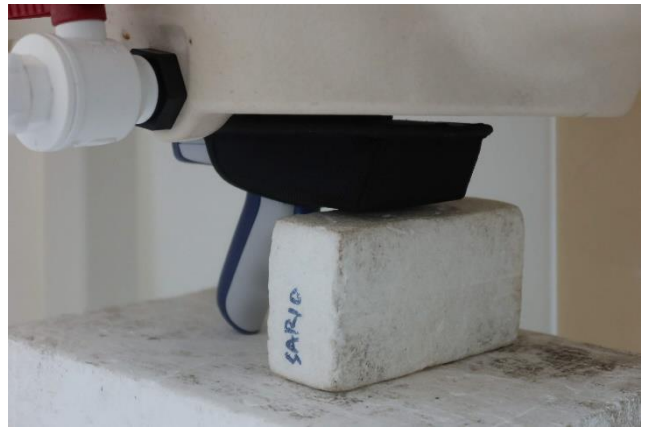
Front (Wired(GUN)) with Holster at 0mm