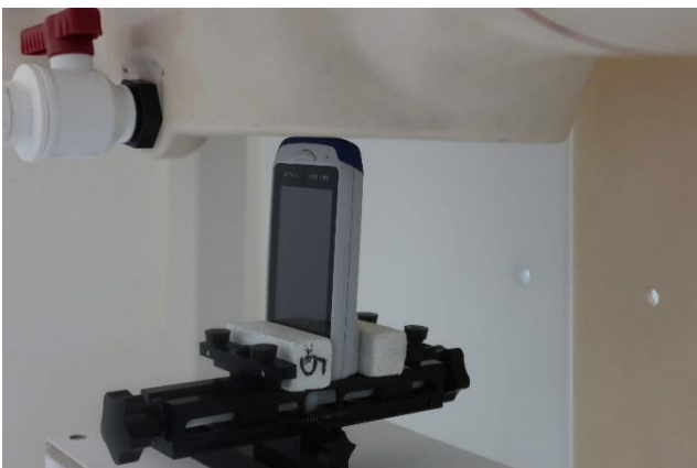
Bottom side(Hand-held) at 0 mm