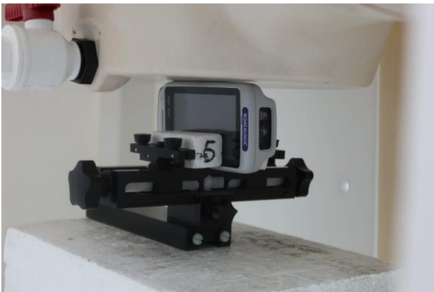
Left side(Hand-held) at 0 mm