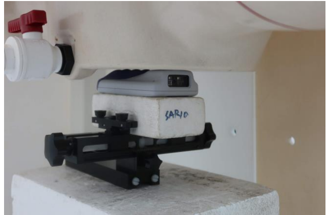
Back(Hand-held) at 0mm