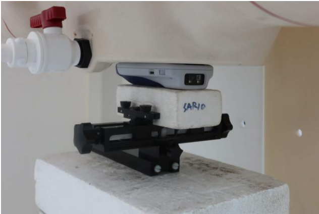
Front(Hand-held) at 0 mm