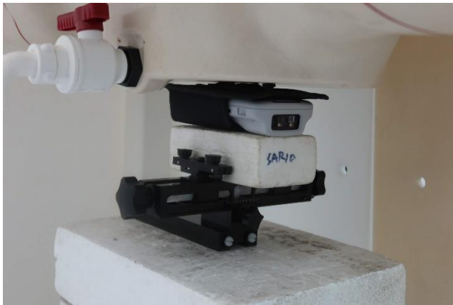
Front (Hand-held) with Holster at 0mm