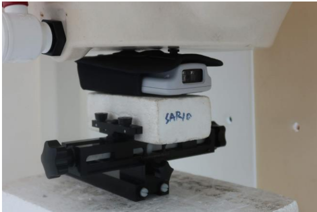
Back (Hand-held) with Holster at 0mm