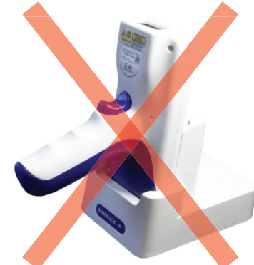
Pistol Grip Models

To confirm the correct insertion, the notification LED starts blinking.