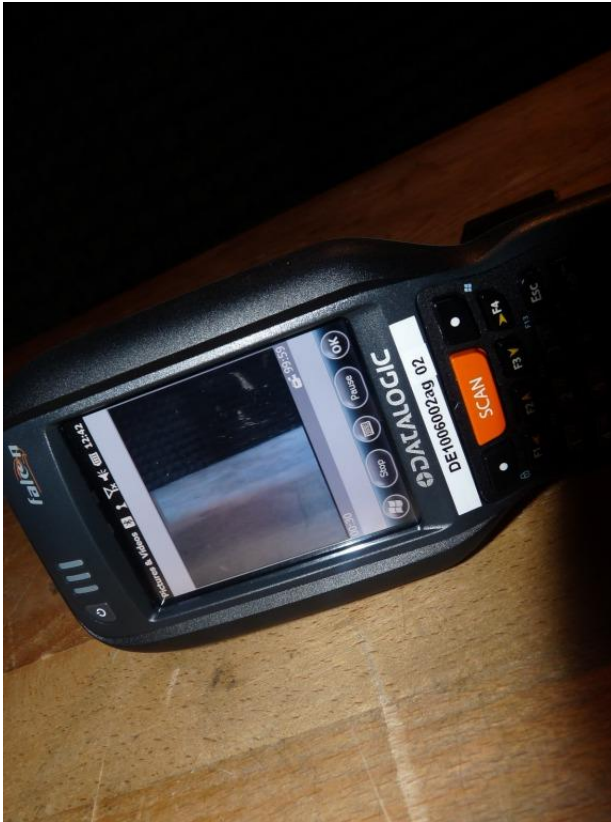
Photo 4: Test setup for radiated measurements (unintentional radiator §15); Setup AJ01 (video recording)