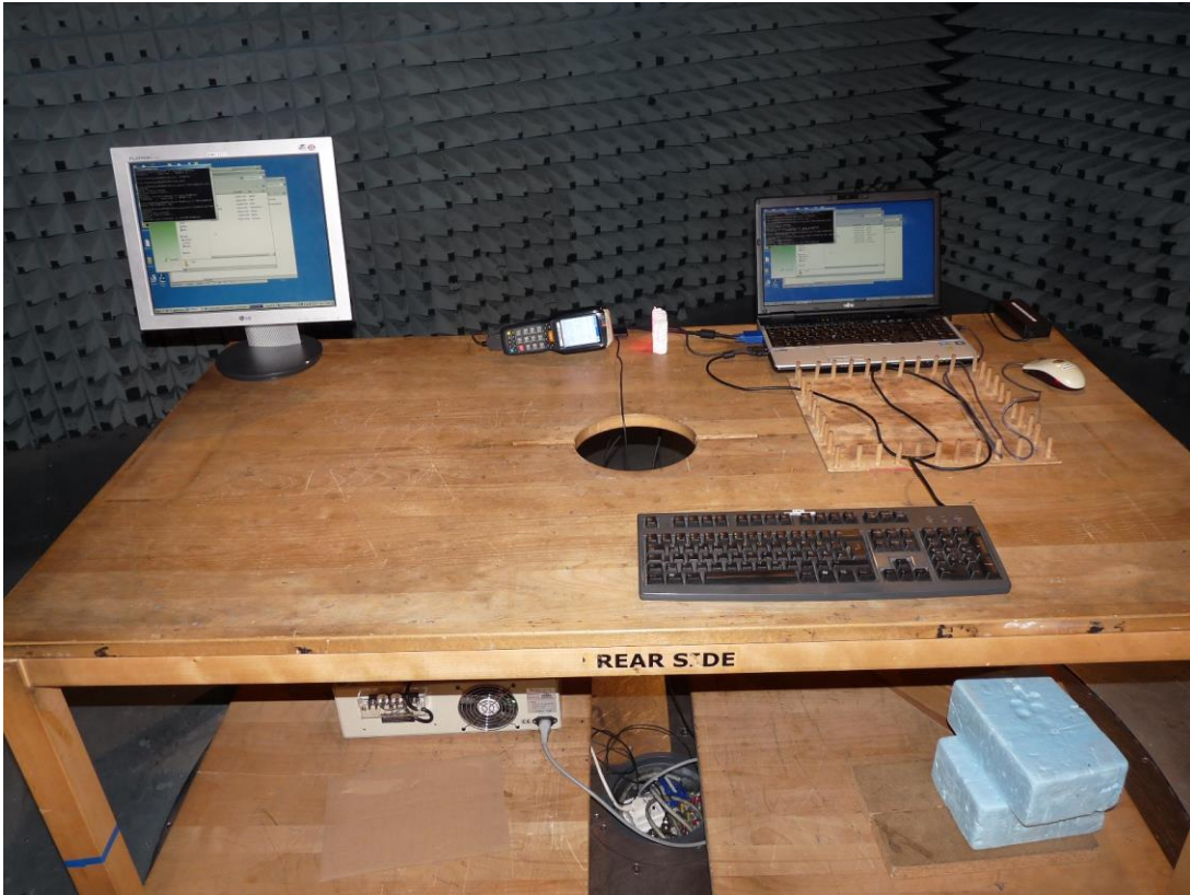
Photo 1: Test setup for radiated measurements (unintentional radiator §15); Setup AH01