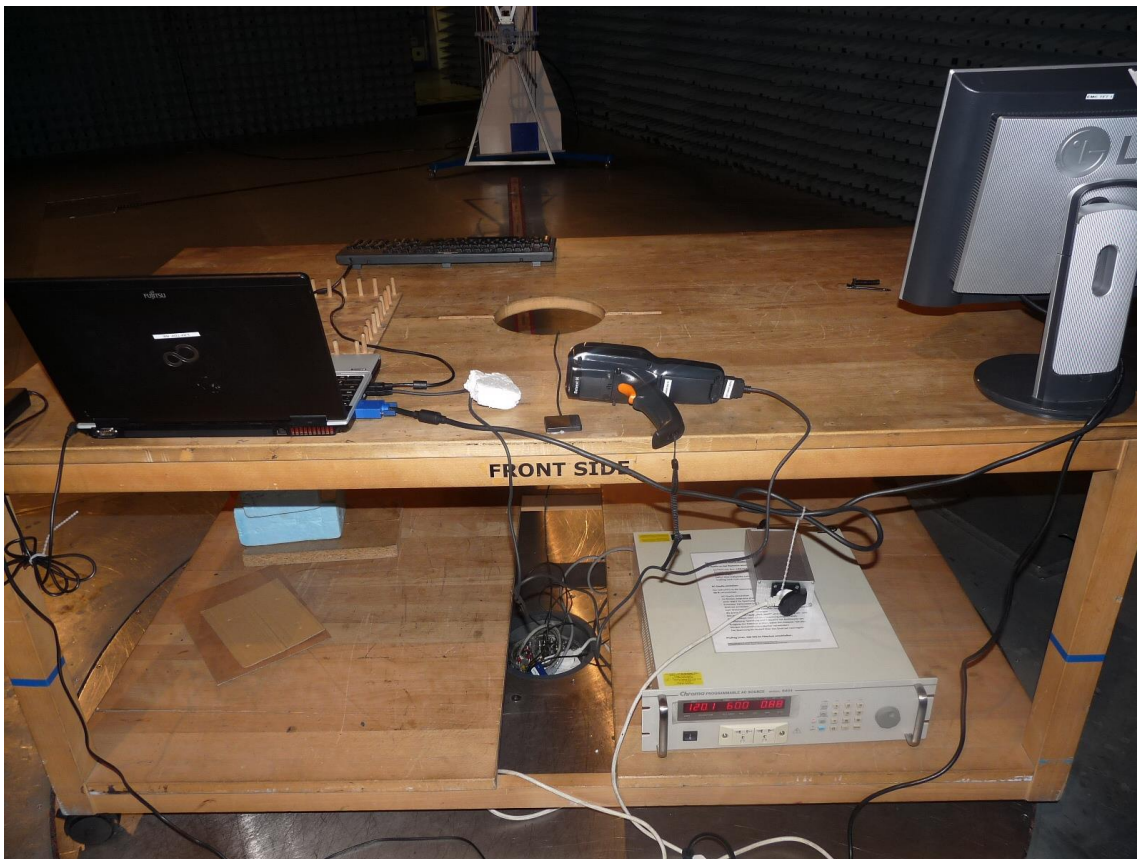
Photo 2: Test setup for radiated measurements (unintentional radiator §15) ; Setup AH01