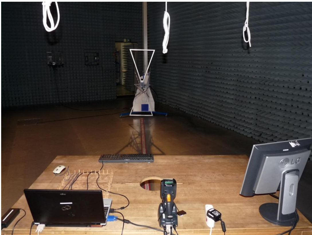
Photo 4: Test setup for radiated measurements (unintentional radiator §15)