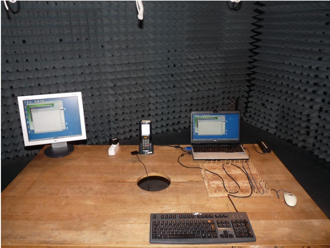
Photo 3: Test setup for radiated measurements (unintentional radiator §15)