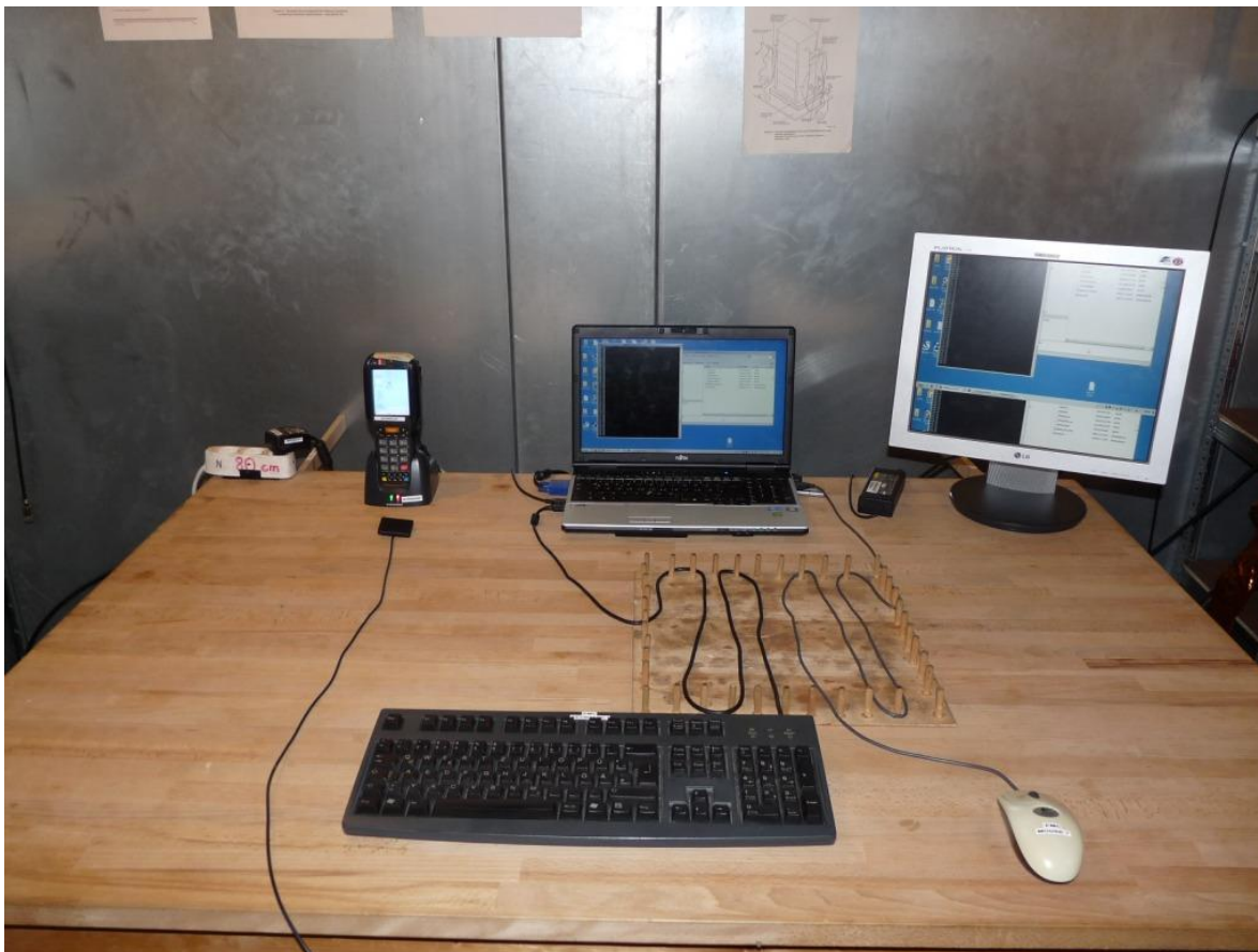
Photo 1: Test setup for conducted measurements (AC Port (power line), unintentional radiator §15)