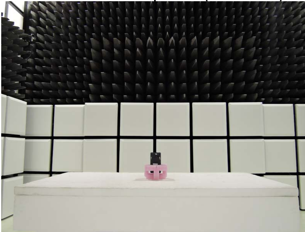
Antenna with H polarization