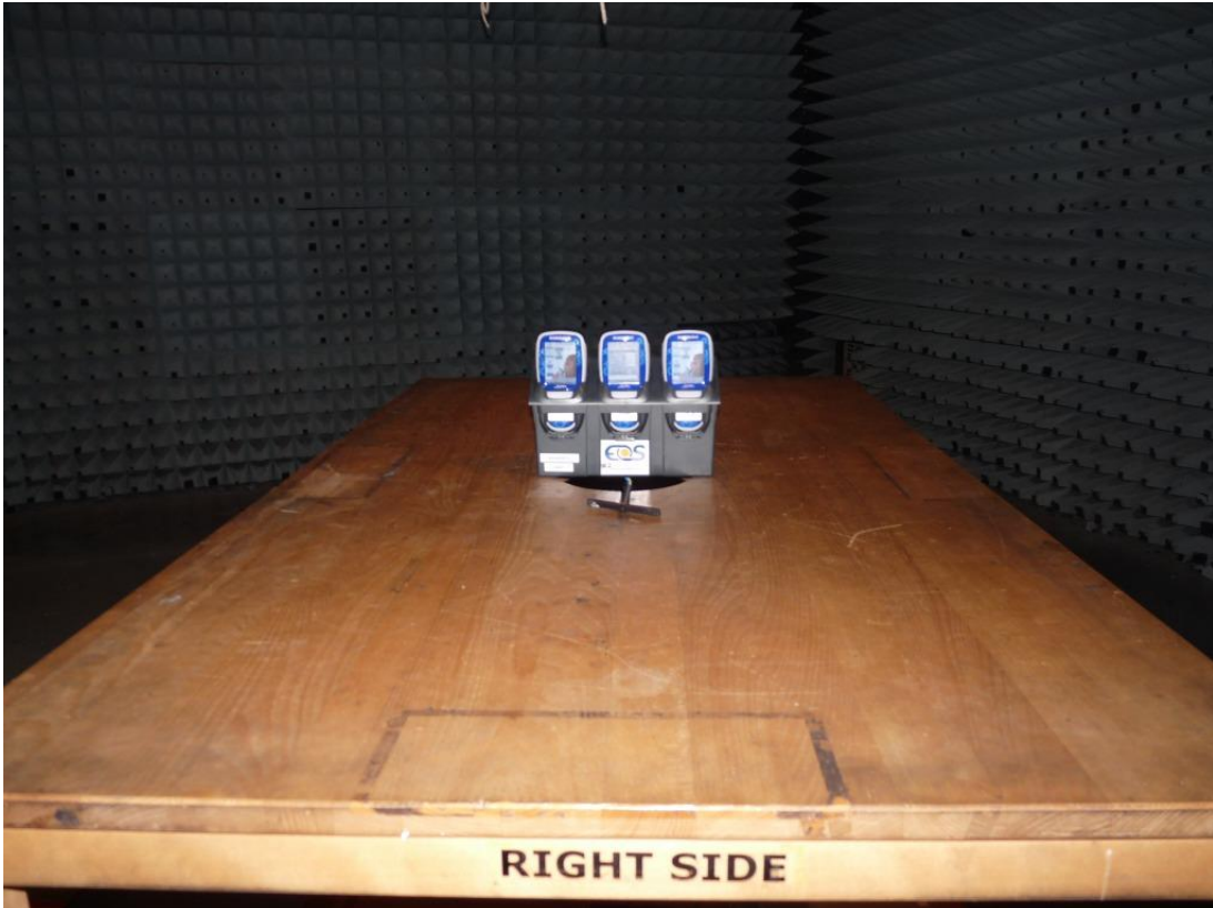
Photo 5: Test setup for radiated measurements, computer peripheral setup, EUT connected via USB cable to computer, intentional/ unintentional radiator §15.