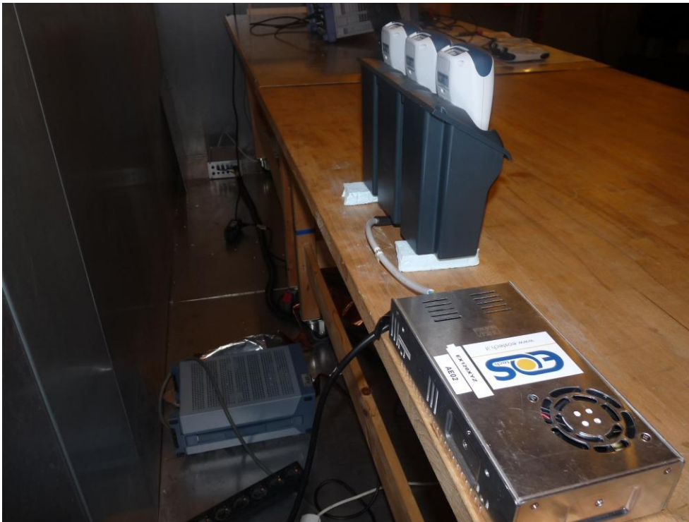
Photo 2: Test setup for conducted measurements (computer peripheral setup, EUT connected via USB cable to computer, intentional/ unintentional radiator §15.)