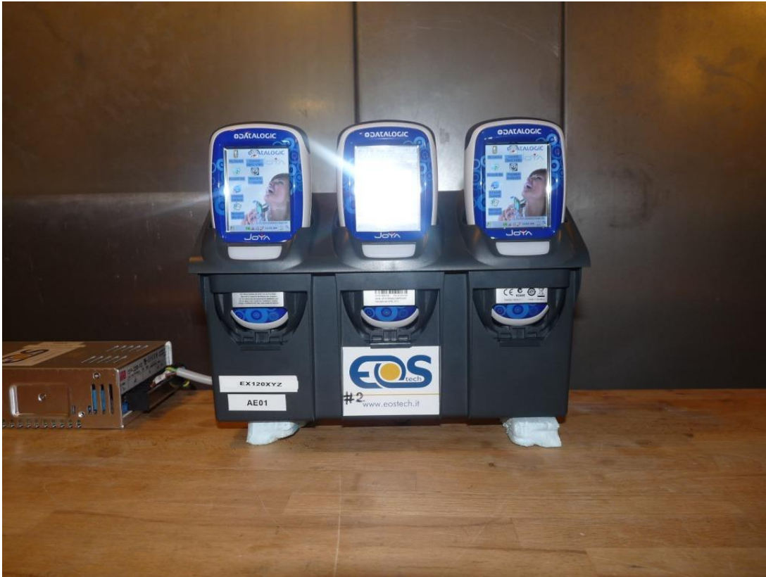
Photo 3: Test setup for conducted measurements (computer peripheral setup, EUT connected via USB cable to computer, intentional/ unintentional radiator §15.)