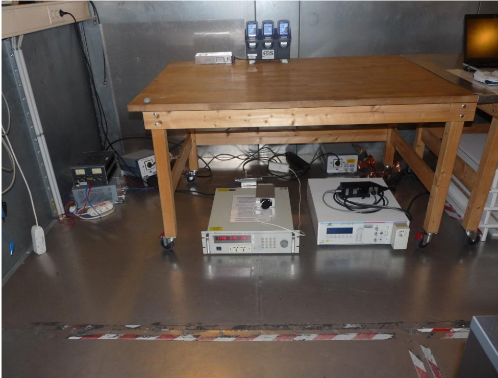
Photo 1: Test setup for conducted measurements (computer peripheral setup, EUT connected via USB cable to computer, intentional/ unintentional radiator §15.)