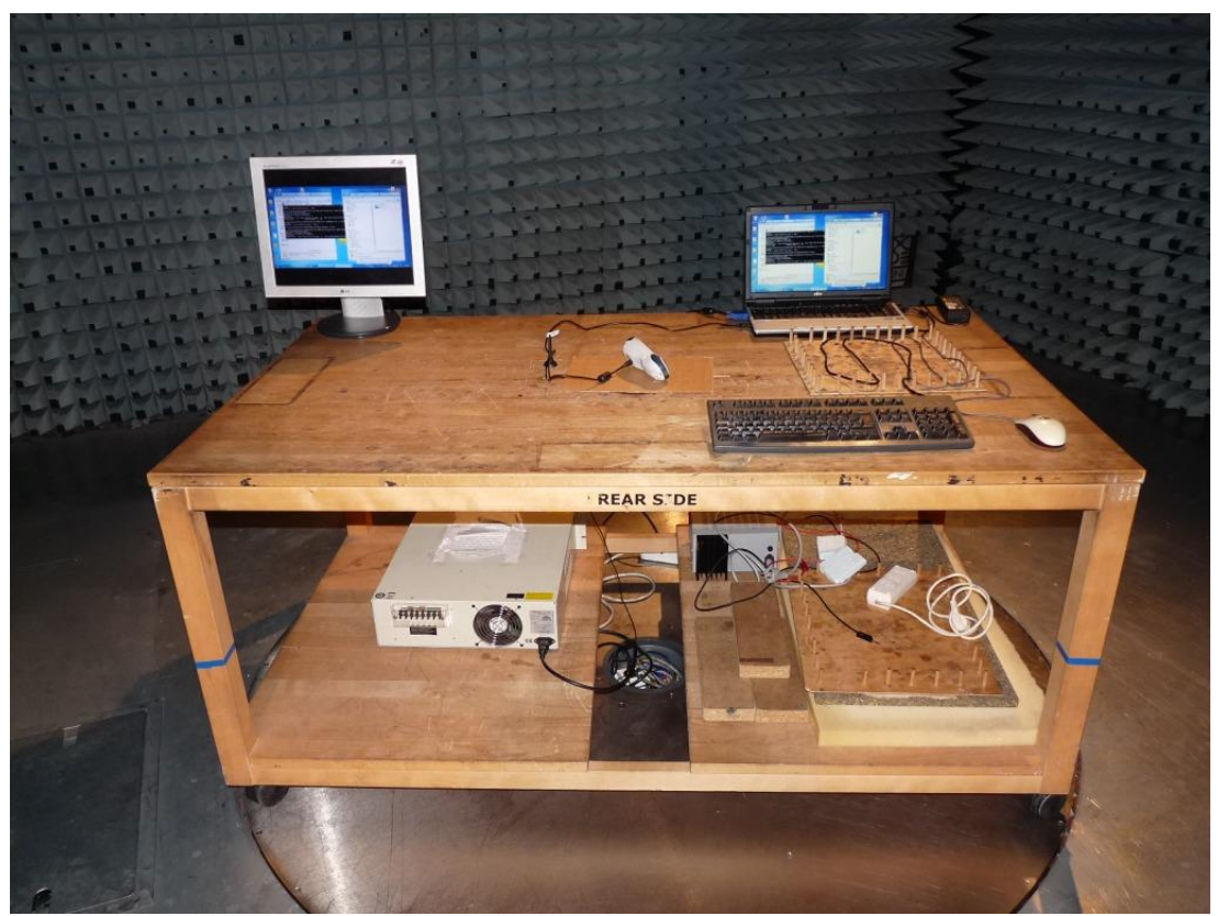
Photo 4: Test setup for radiated measurements, computer peripheral setup, EUT connected via USB cable to computer, intentional/ unintentional radiator §15.