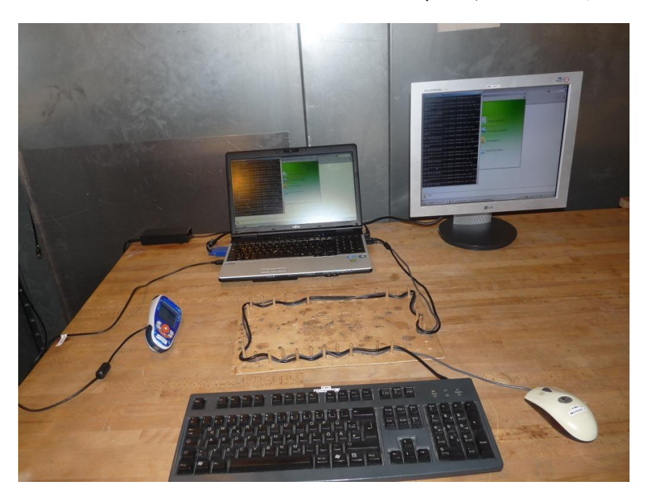
Photo 2: Test setup for conducted measurements (computer peripheral setup, EUT connected via USB cable to computer, intentional/ unintentional radiator §15.)