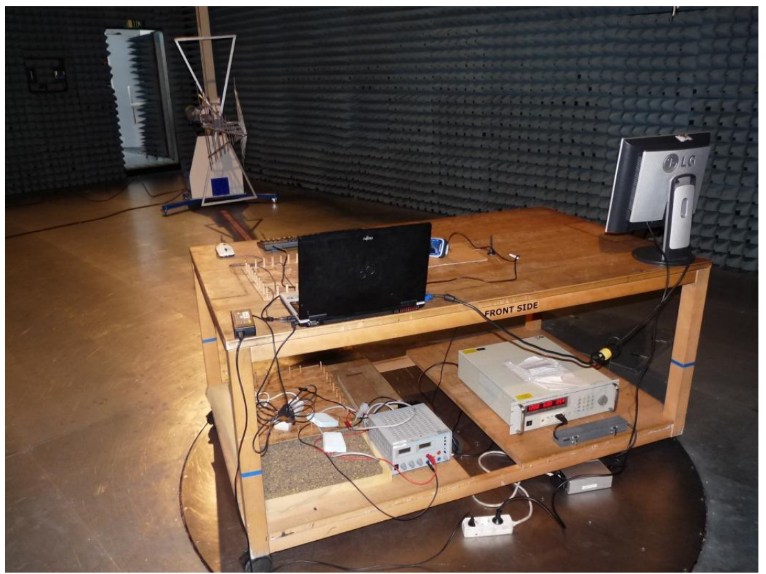
Photo 5: Test setup for radiated measurements, computer peripheral setup, EUT connected via USB cable to computer, intentional/ unintentional radiator §15.