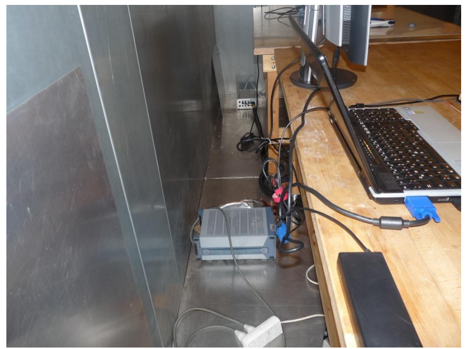
Photo 3: Test setup for conducted measurements (computer peripheral setup, EUT connected via USB cable to computer, intentional/ unintentional radiator §15.)