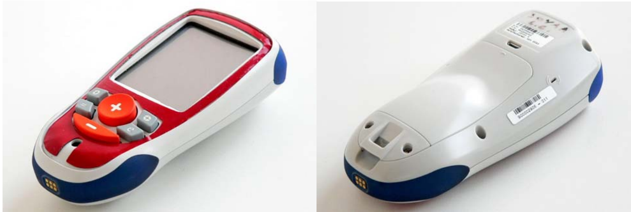
Fig. 1: Pictures of the Joya+ A.