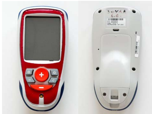
Fig. 16: Front and back view of the test device Datalogic Joya+ A.

Figure 16 - 17 show the devices under test.