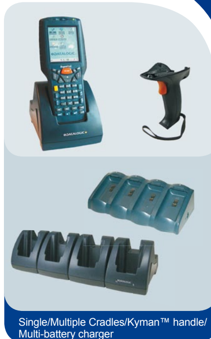
Single/Multiple Cradles/Kyman™ handle/ Multi-battery charger