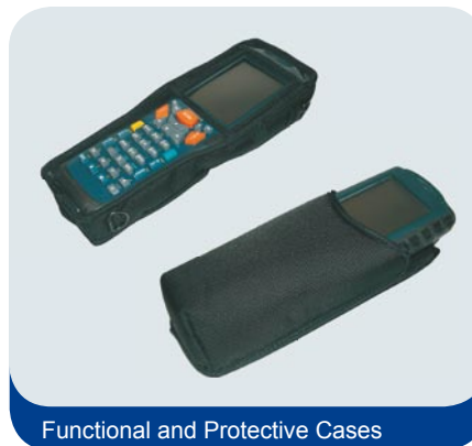
Functional and Protective Cases