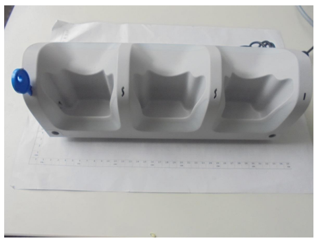
Photograph 1: Equipment under test