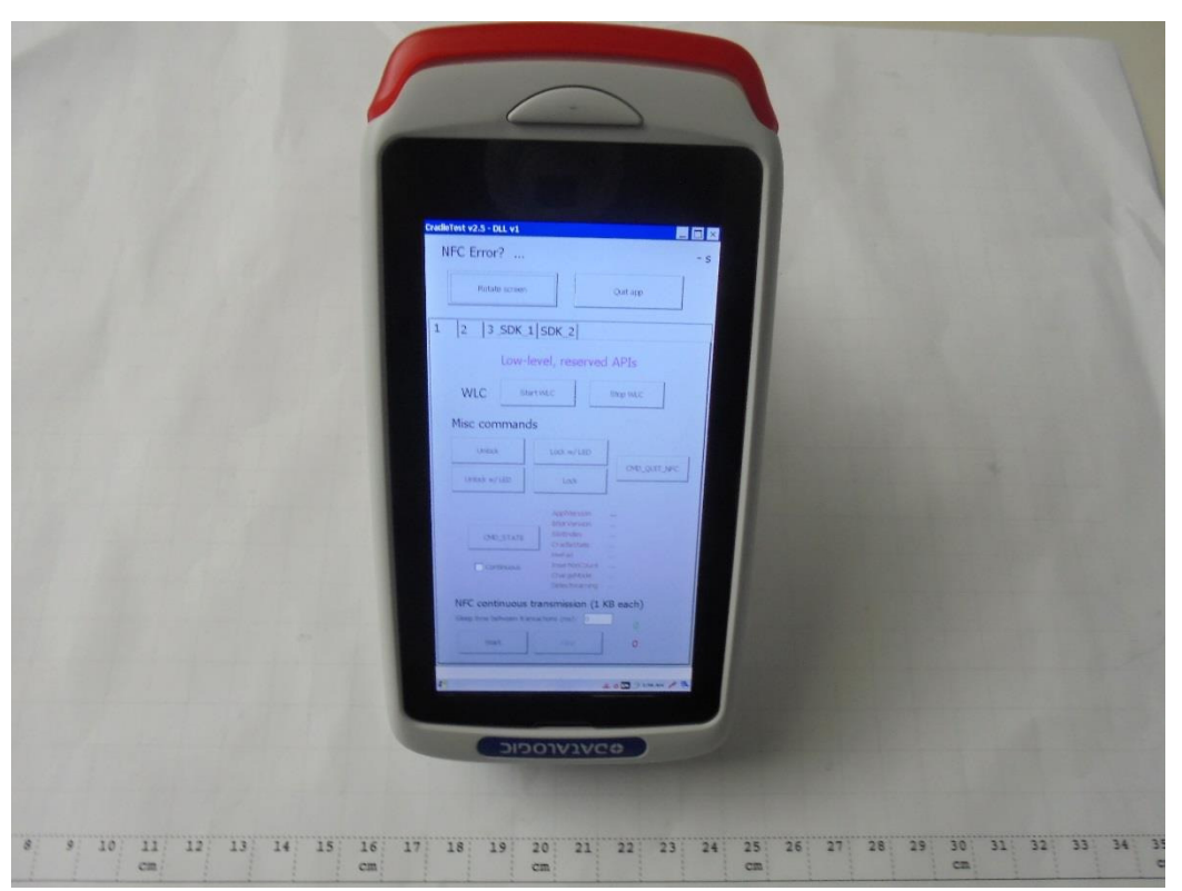
Photograph 3 : Auxiliary Equipment under test (AE 2 front side, identical to AE 3)