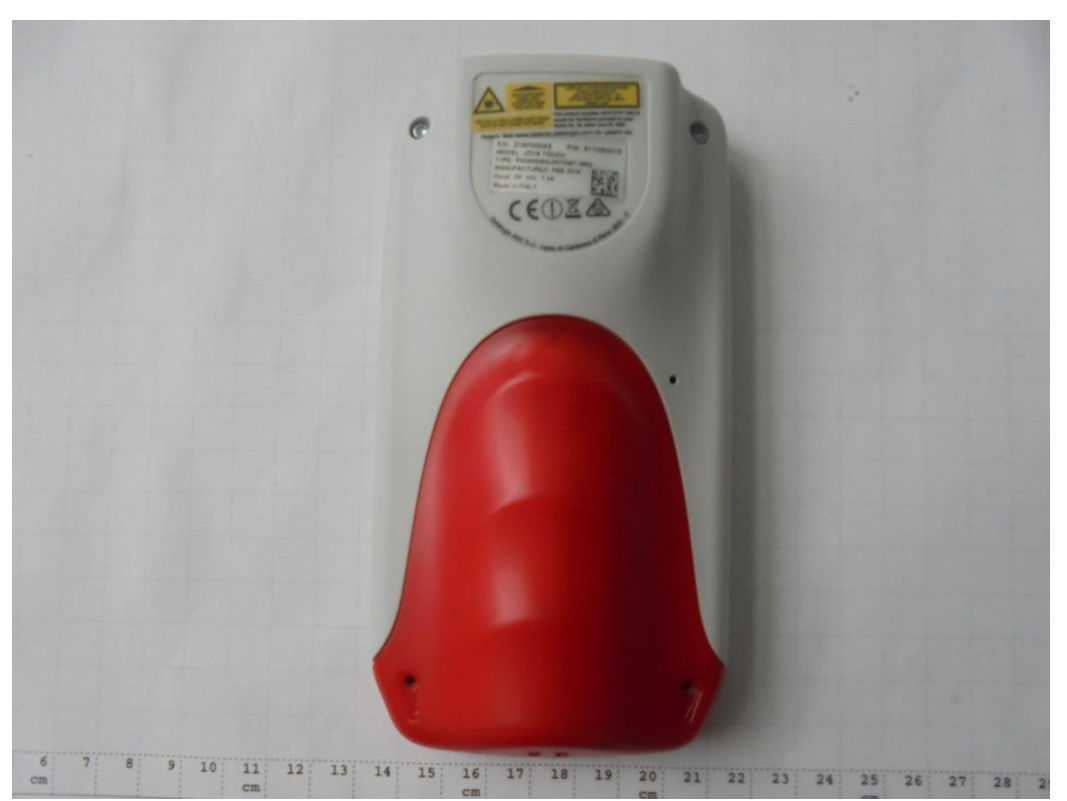
Photograph 6: Auxiliary Equipment under test (AE 1 rear side)