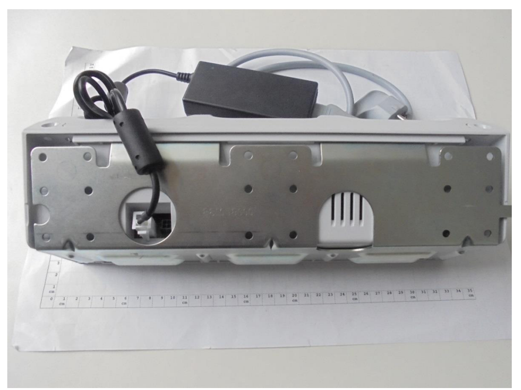
Photograph 2 : Equipment under test (rear side with AE 5)