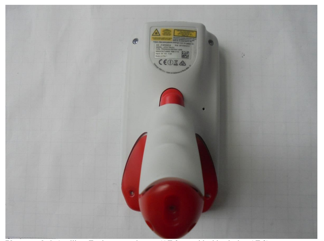
Photograph 4 : Auxiliary Equipment under test (AE 2 rear side, identical to AE 3)