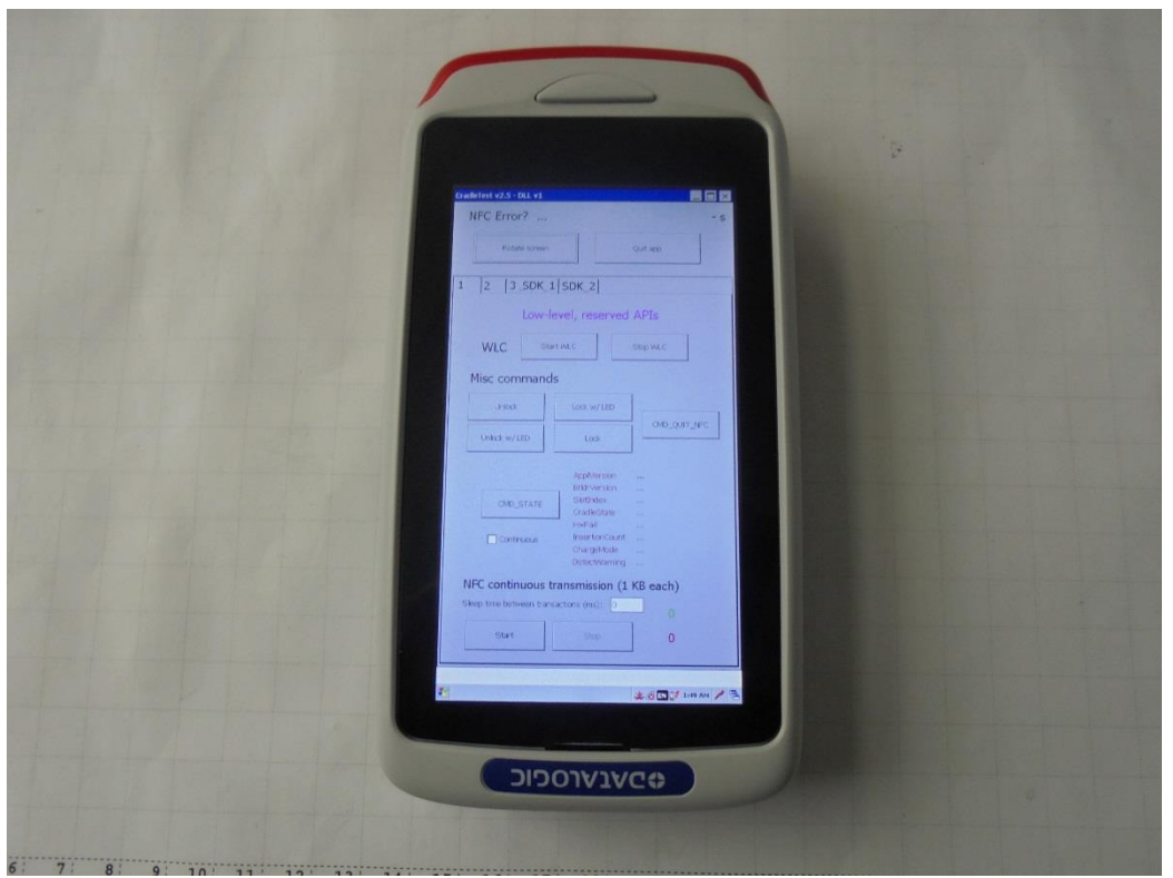
Photograph 5: Auxiliary Equipment under test (AE 1 front side)