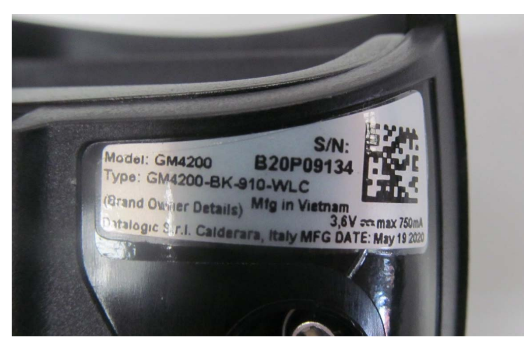
Photograph A2-6: Label of reader used with charging stand EUT #1