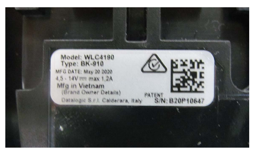
Photograph A2-2: Charging stand EUT #1, label