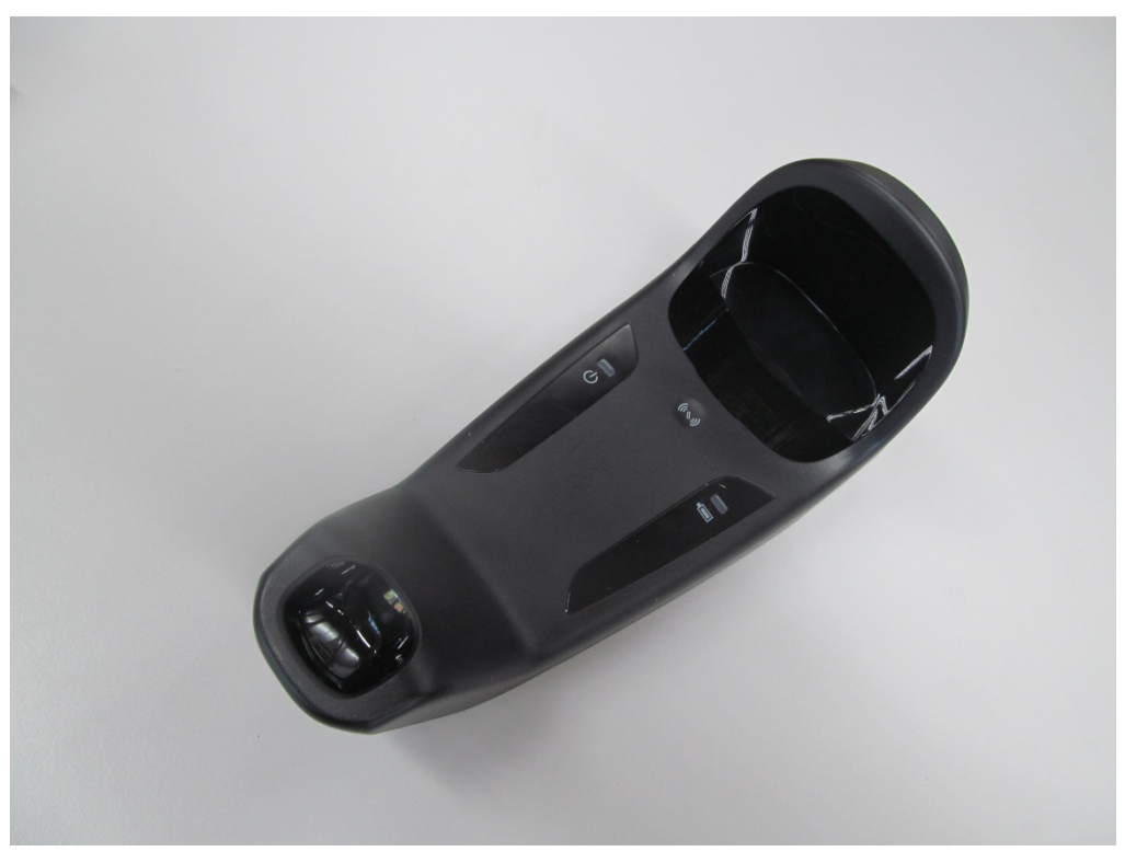
Photograph A2-1: Charging stand EUT #1