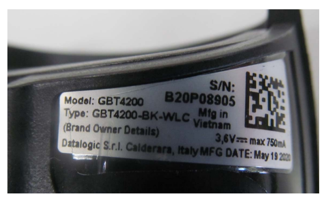
Photograph A2-8: Label of reader used with charging stand EUT #2