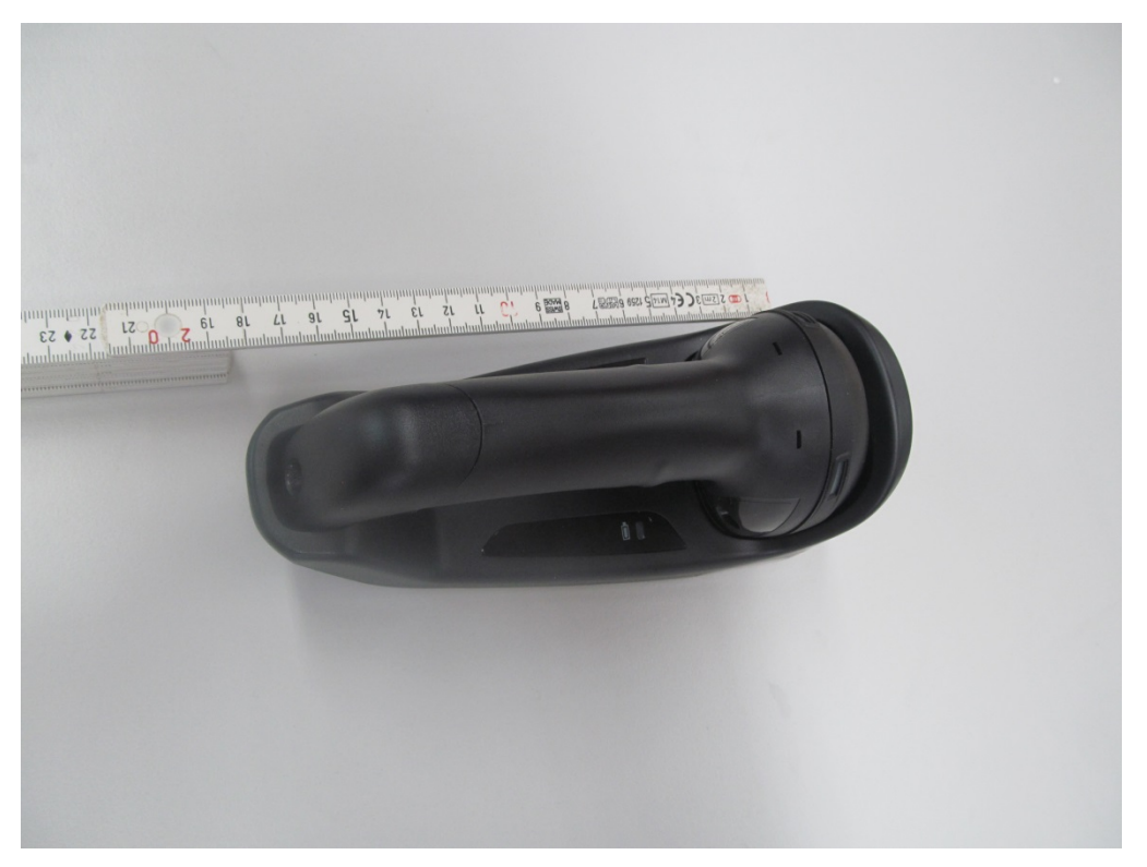
Photograph A2-9: Reader in combination with charging stand EUT #1