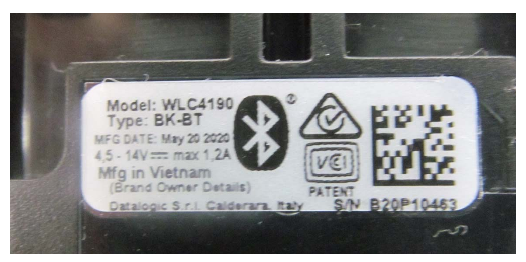
Photograph A2-4: Charging stand EUT #2, label