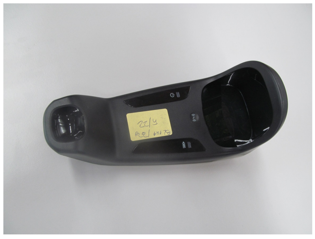
Photograph A2-3: Charging stand EUT #2