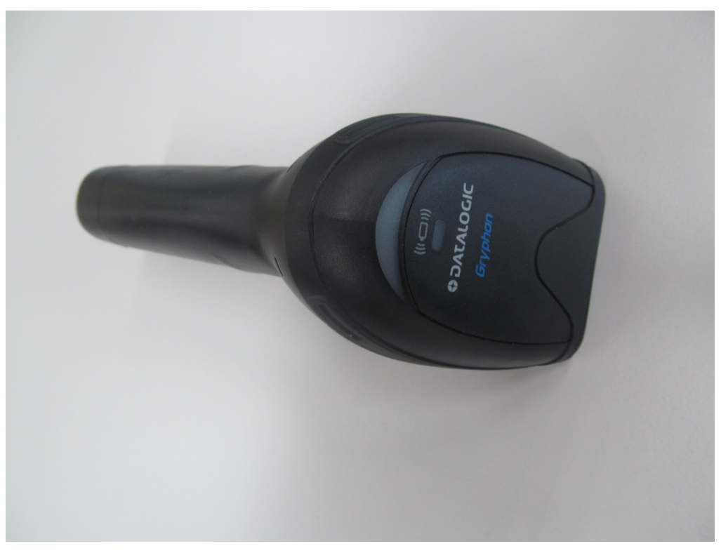
Photograph A2-7: Reader used with charging stand EUT #2