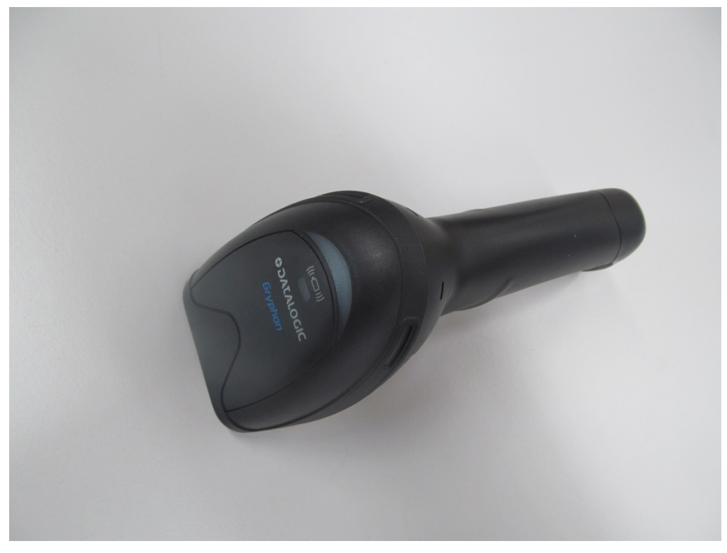
Photograph A2-5: Reader used with charging stand EUT #1