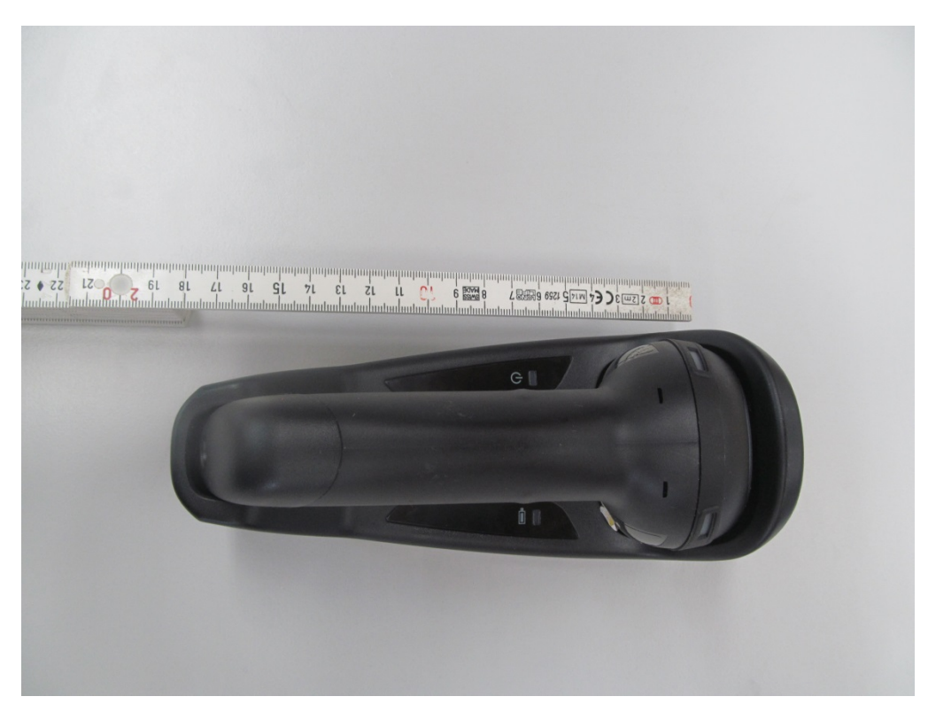
Photograph A2-10: Reader in combination with charging stand EUT #2