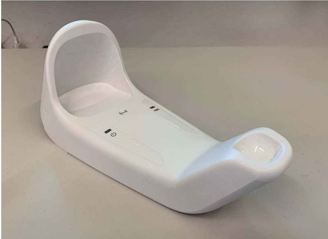
Health Care variant - pictures 1/2