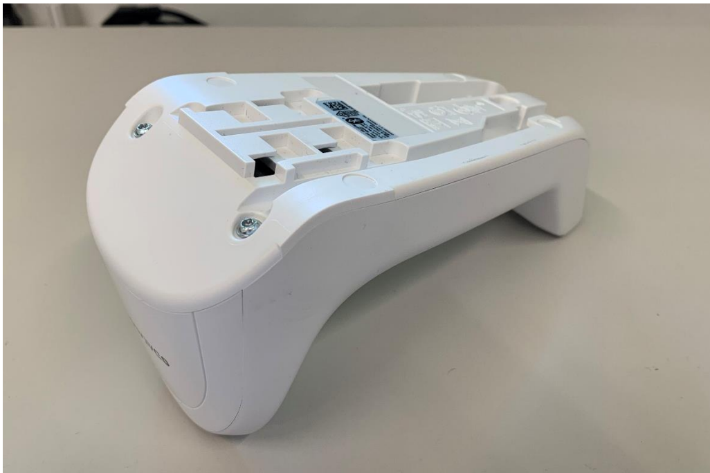
White variant - picture 2/2