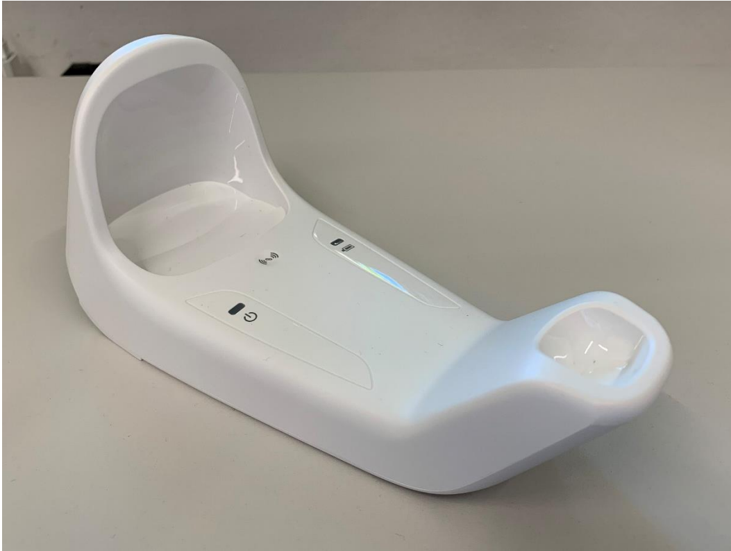
White variant – picture 1/2