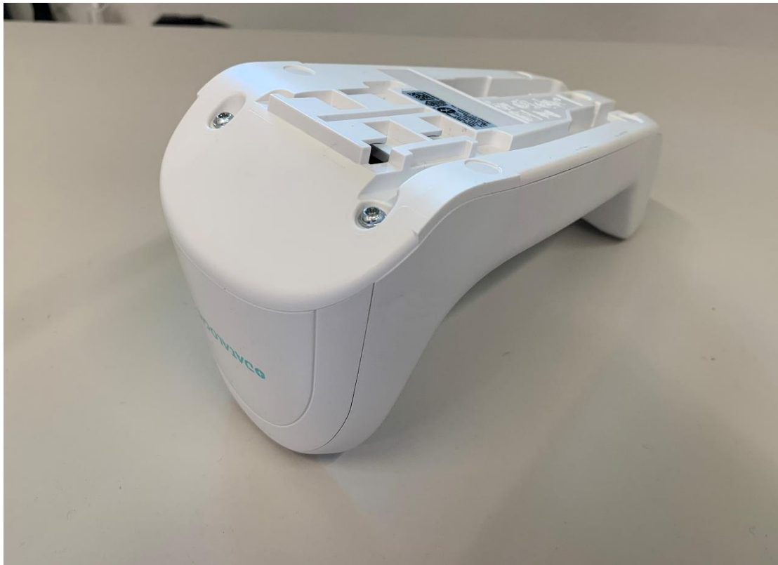
Health care variant - picture 2/2