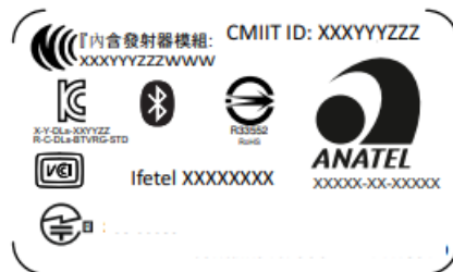
Mark label 2