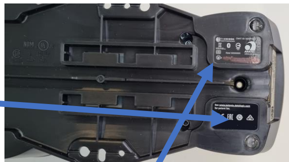
Mark Label 1