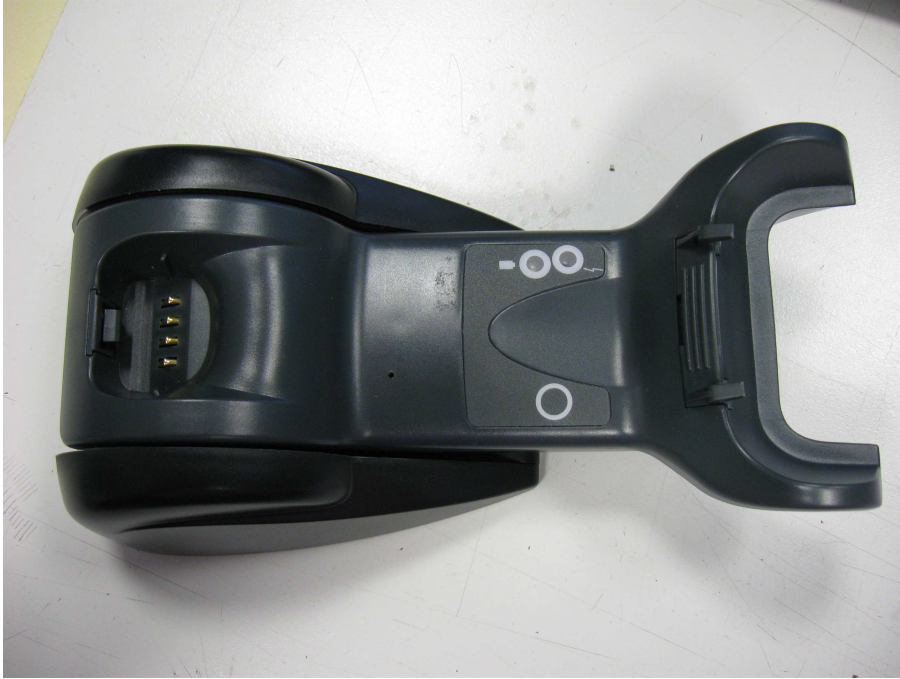
Fig. 1: Overall view of the base station