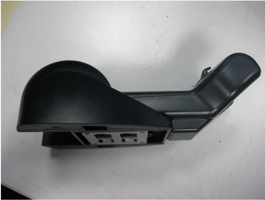
Fig. 3: Rear side of the base station