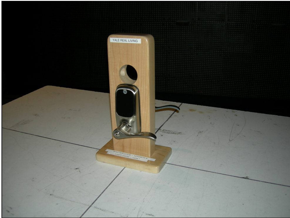
Figure 1: Radiated Emissions – Touch Screen Lever – YRT220-ZW