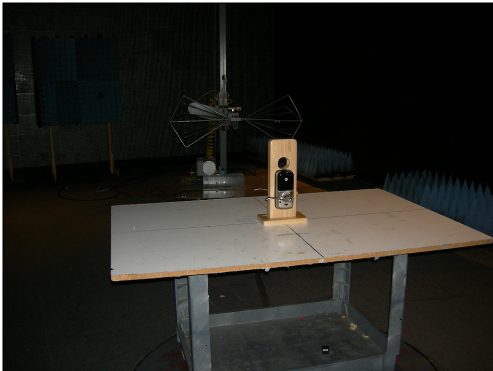
Figure 2: Radiated Emissions – Touch Screen Lever – YRT220-ZW