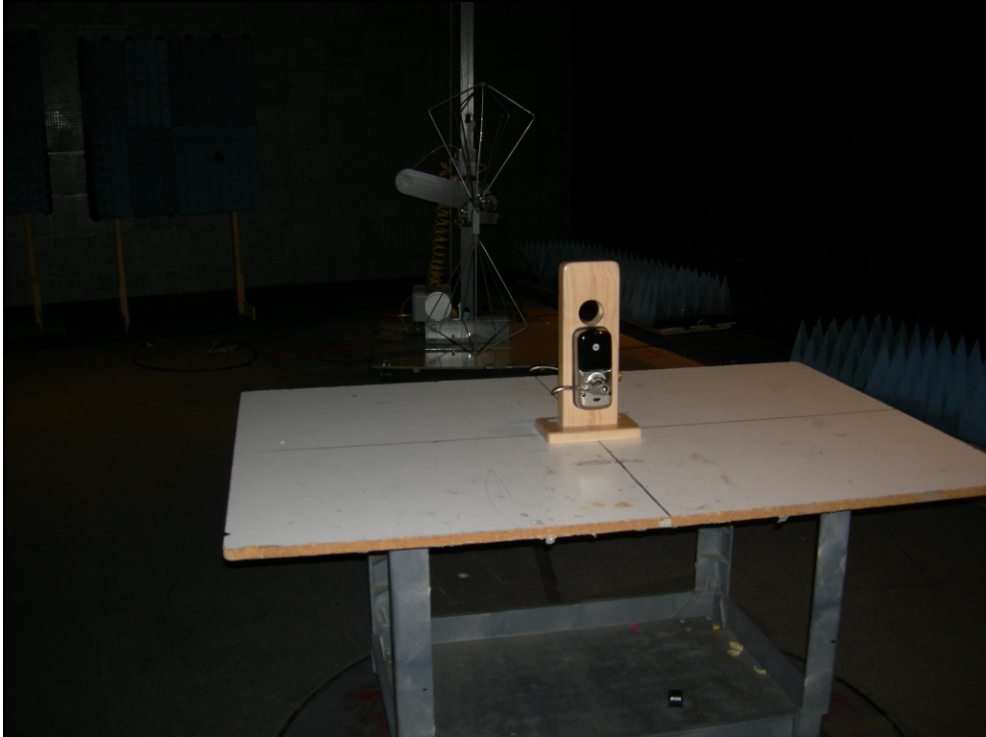
Figure 4: Radiated Emissions – Push Button Lever – YRT210-ZW