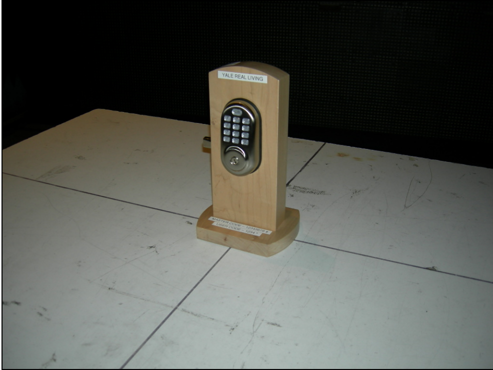
Figure 5: Radiated Emissions – Push Button Deadbolt – YRD210-ZW