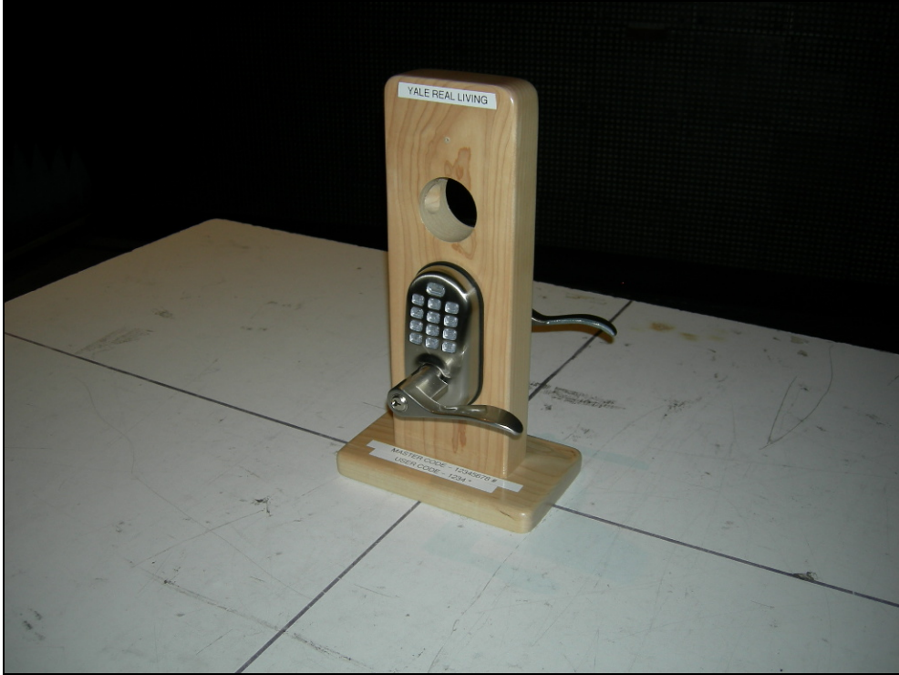
Figure 3: Radiated Emissions – Push Button Lever – YRT210-ZW