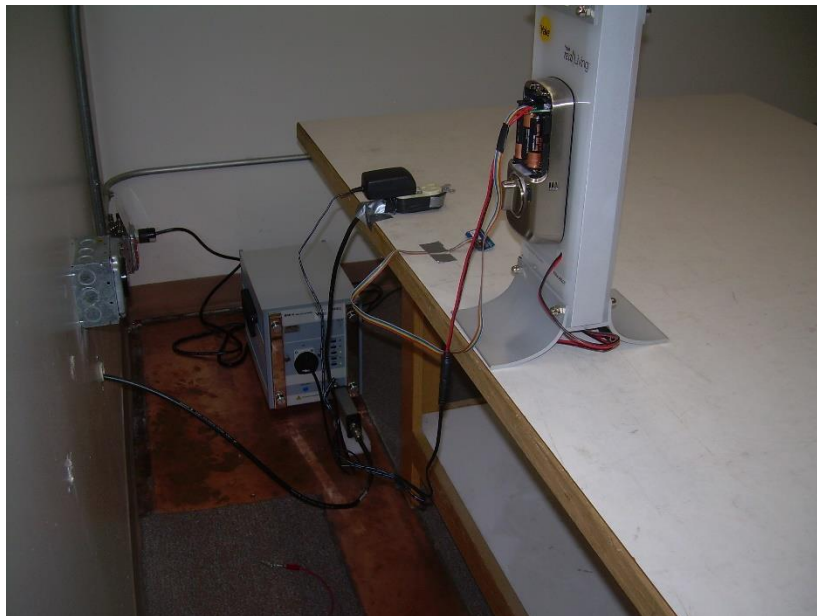
Photograph 6: Back View Conducted Emissions Worst-Case Configuration