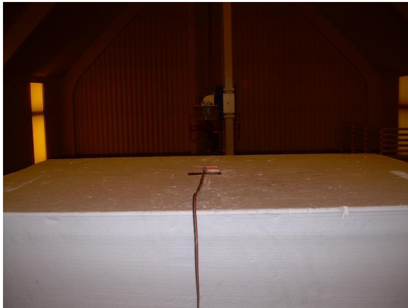
Photograph 4: Back View Radiated Emissions Worst Case – Above 1000 MHz Configuration