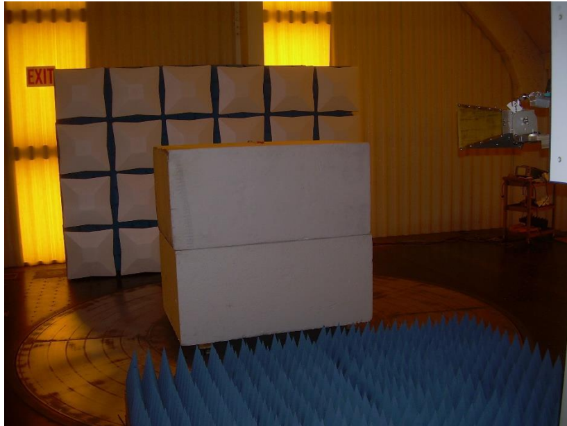
Photograph 3: Front View Radiated Emissions Worst Case – Above 1000 MHz Configuration