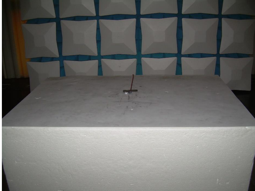
Photograph 1: Front View Radiated Emissions, Worst Case – Below 1000 MHz Configuration