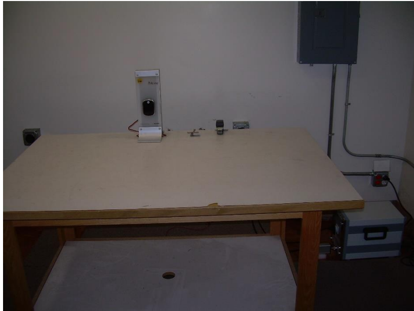
Photograph 5: Front View Conducted Emissions Worst-Case Configuration