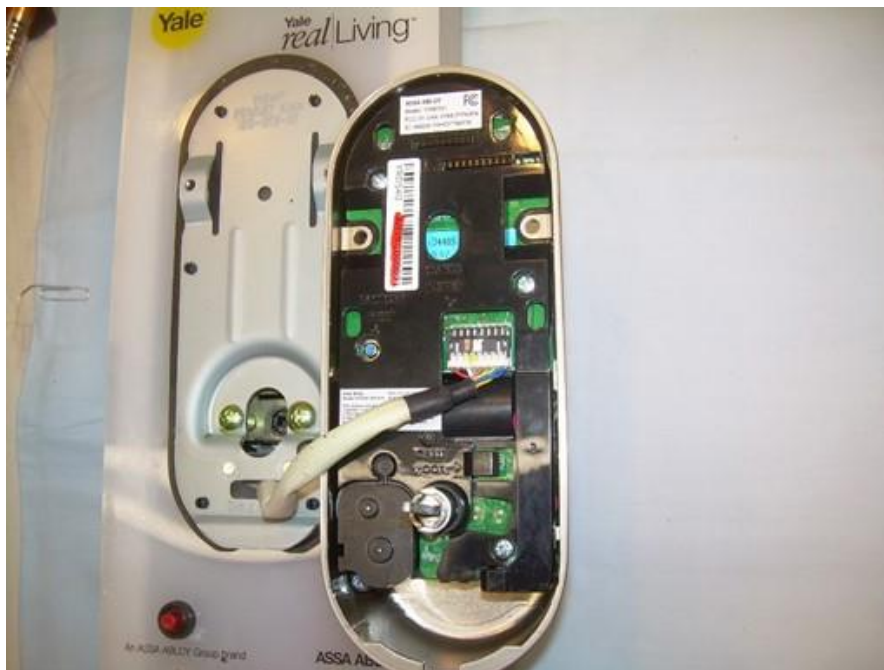
Photograph 4 – View of PCBs and Frame installed in EUT