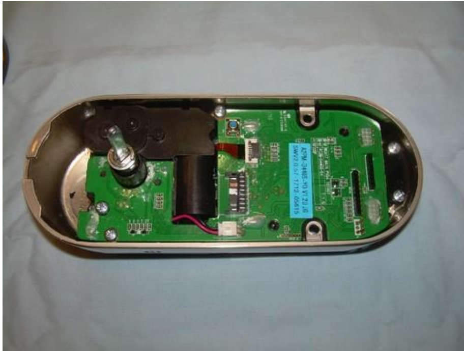
Photograph 5 – Main PCB Mounting in Housing View