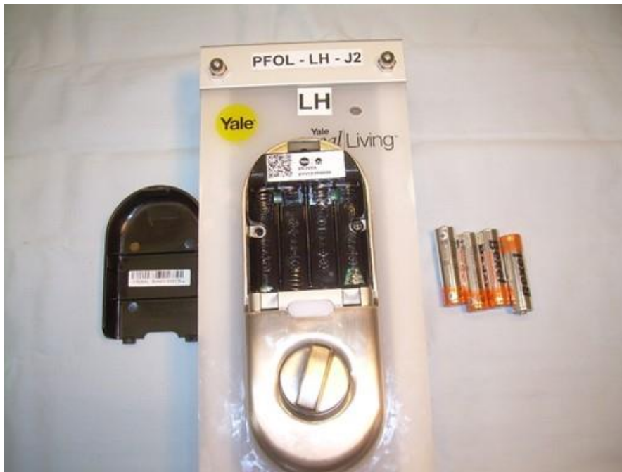
Photograph 3 – View of EUT with Battery Cover Removed