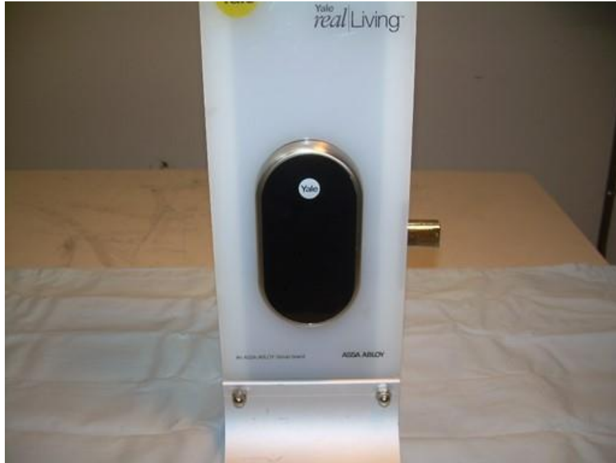
Photograph 1 – Front View of the EUT, Mounted on Stand for Testing