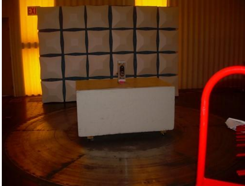
Photograph 1: Front View Radiated Emissions, – 30 MHz to 1000 MHz Configuration