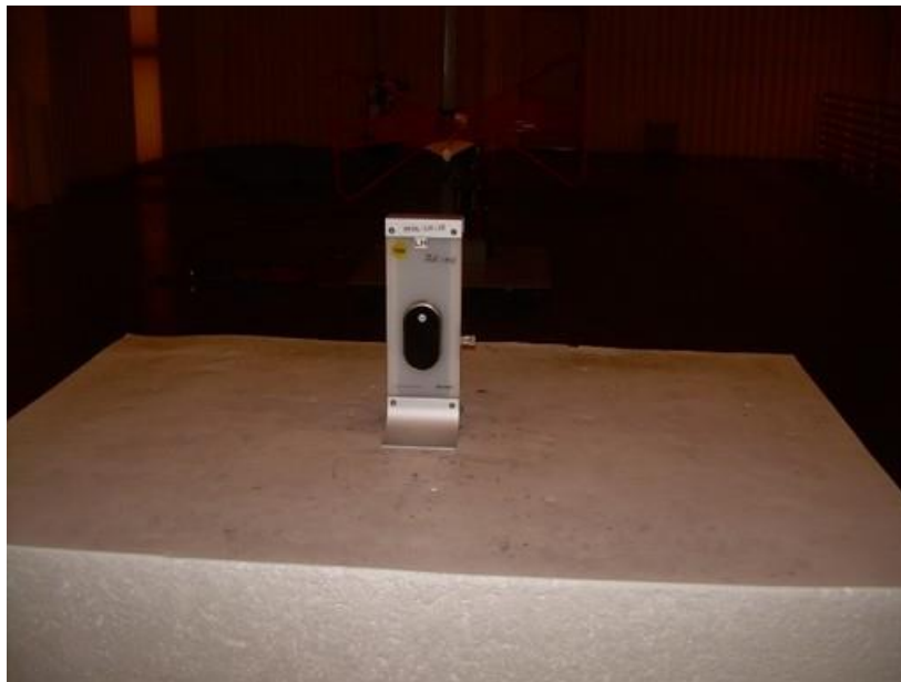
Photograph 2: Back View Radiated Emissions 30 MHz to 1000 MHz Configuration