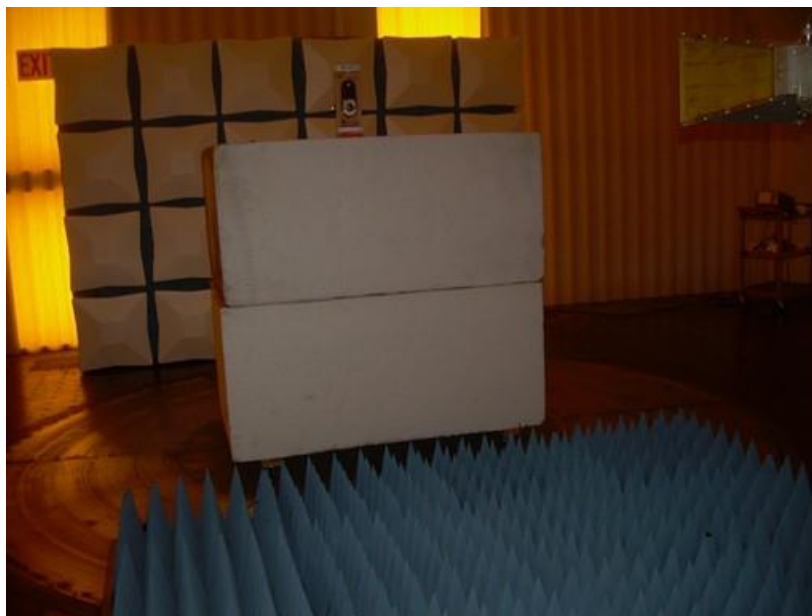
Photograph 3: Front View Radiated Emissions – Above 1000 MHz Configuration