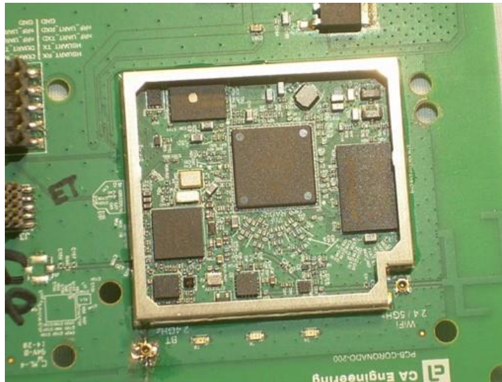
Photograph 3 – View of the Circuitry under the RF Shield