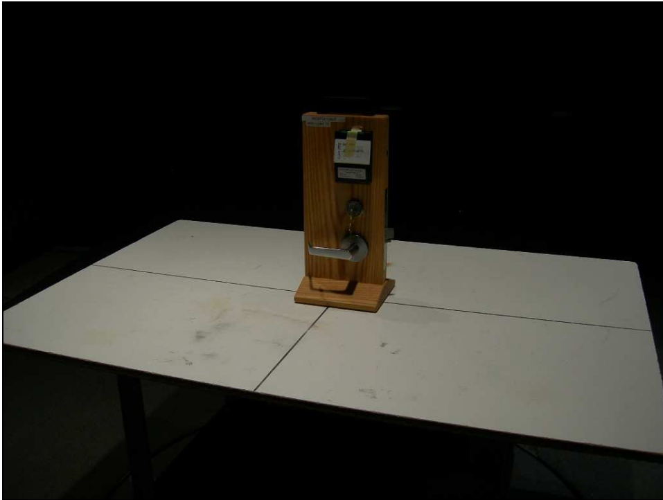
Figure 1: Radiated Emissions