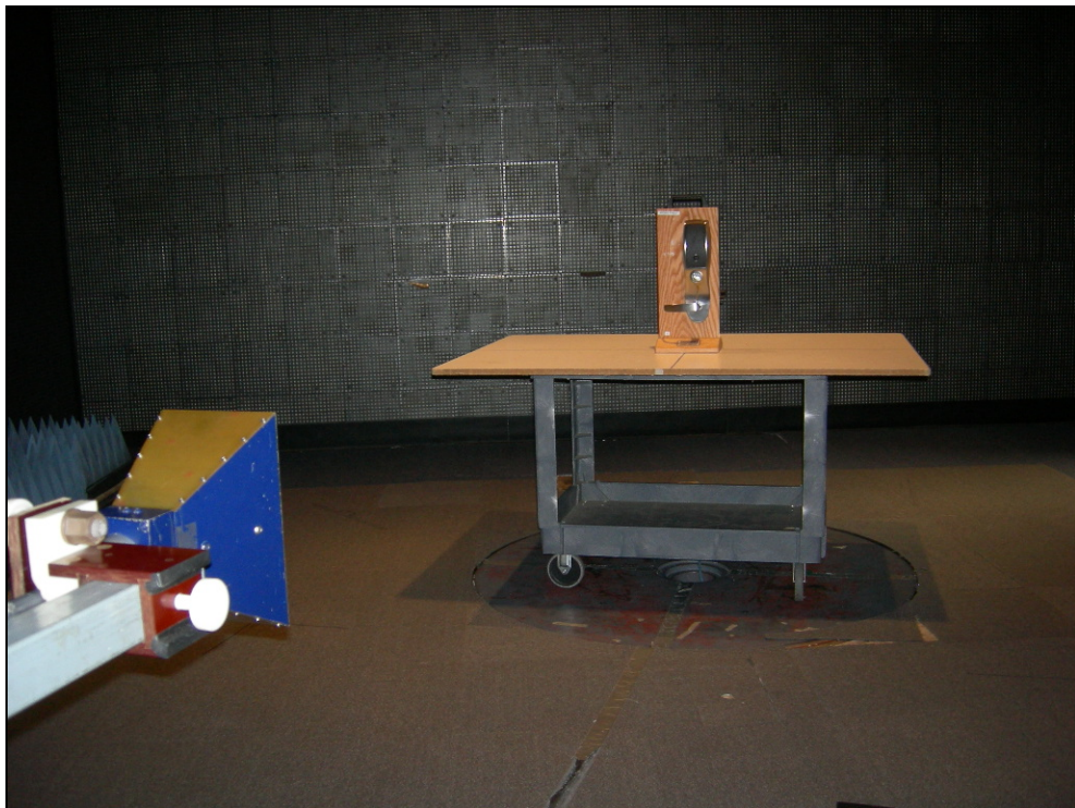
Figure 2: Radiated Emissions - Zigbee