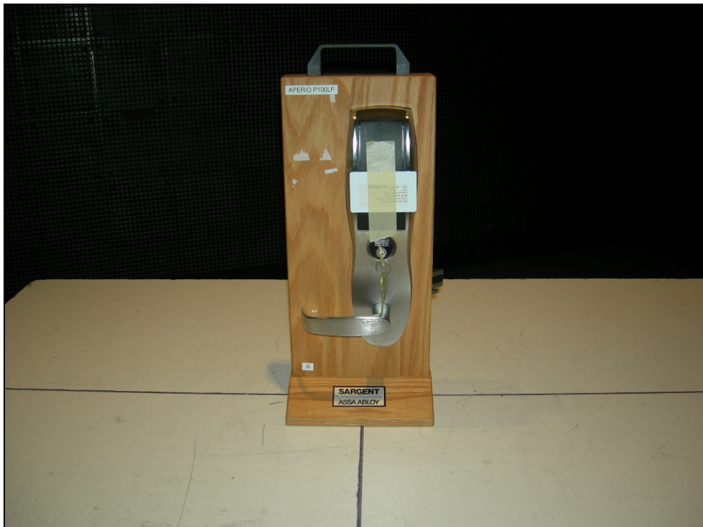
Figure 4: Radiated Emissions – 125kHz Prox