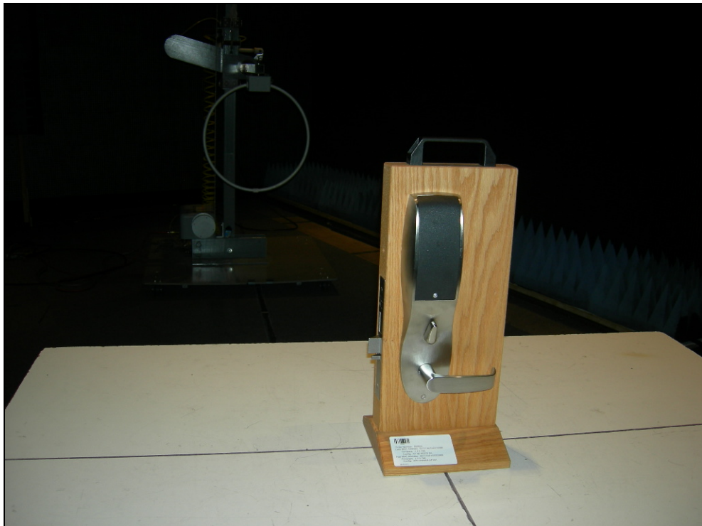
Figure 6: Radiated Emissions – 125kHz Prox