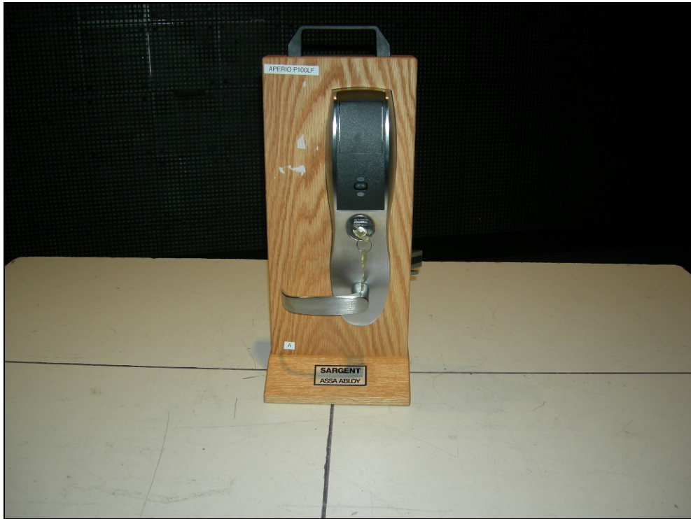
Figure 1: Radiated Emissions - Zigbee