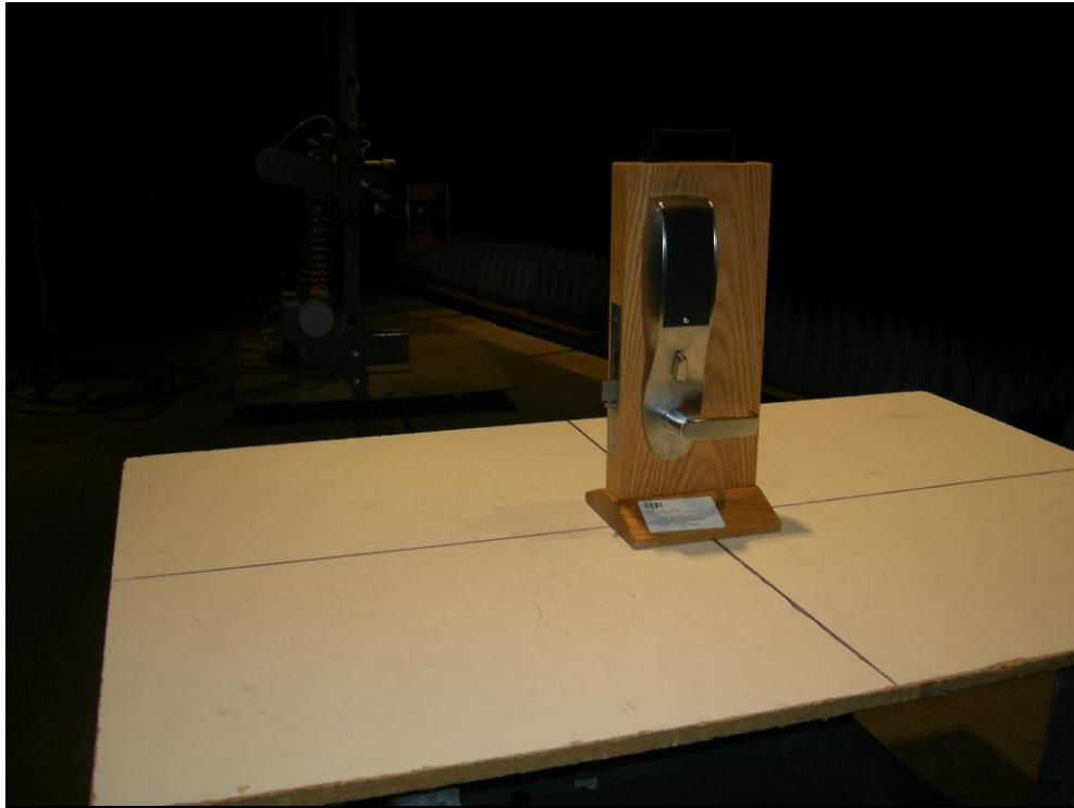
Figure 3: Radiated Emissions – Zigbee