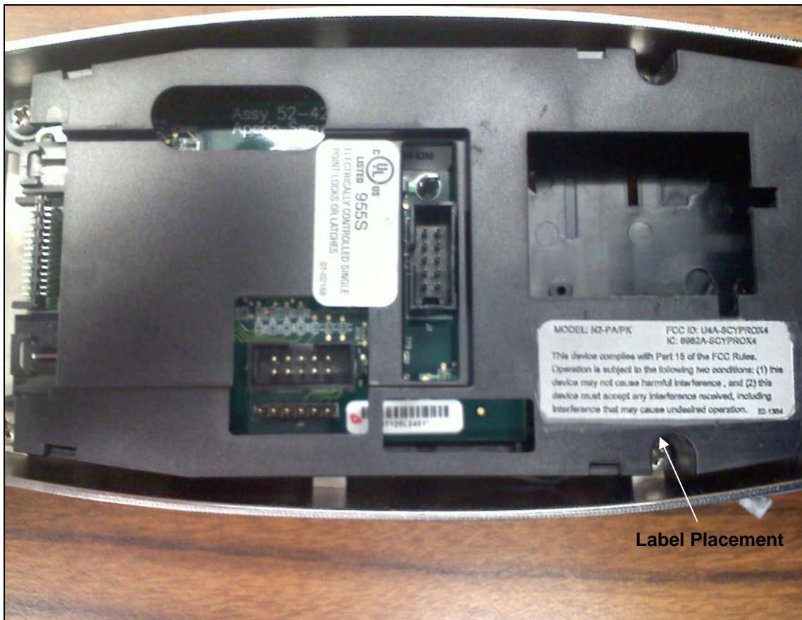
Figure 1: Label Placement