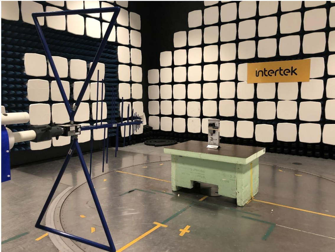
Photo of the test set-up for radiated emission below 1 GHz