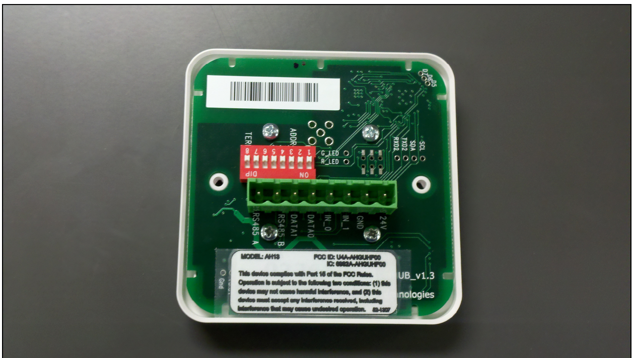
Figure 1: Label Location