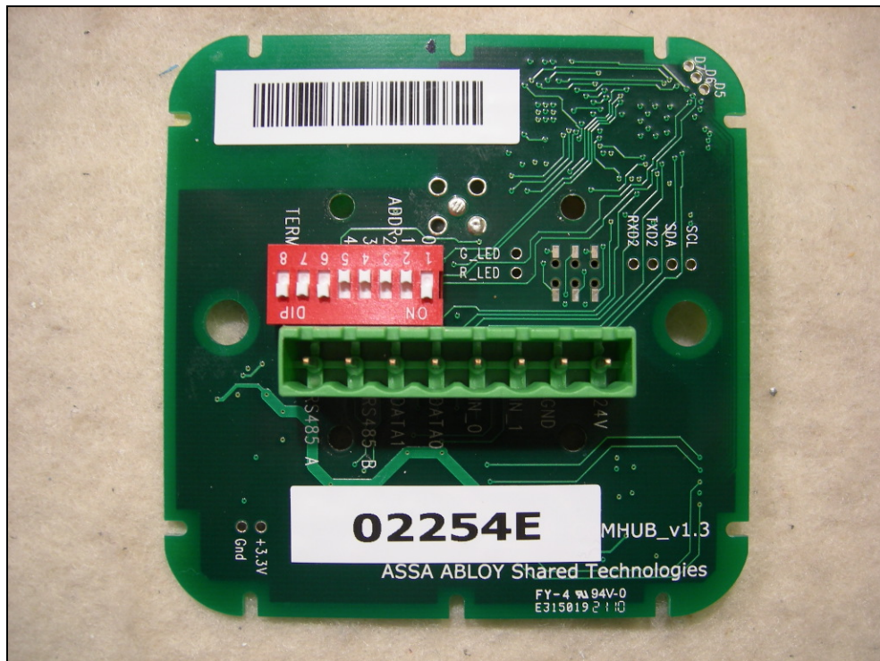
Figure 3: PCB Back