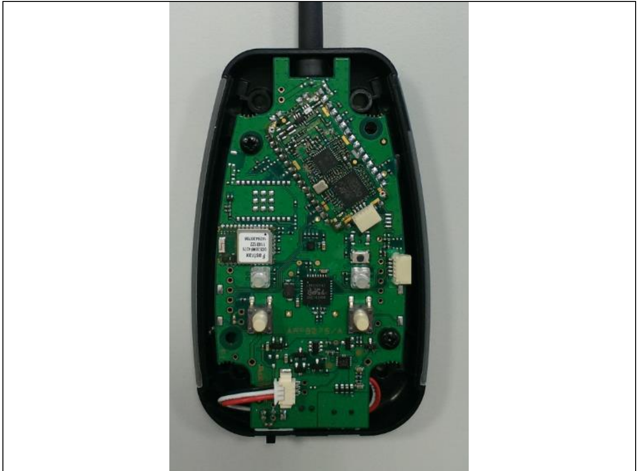
Module w/o shield