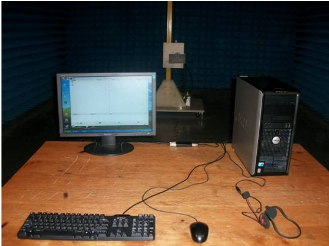
Test photo of radiated emission (1000MHz-5000MHz)