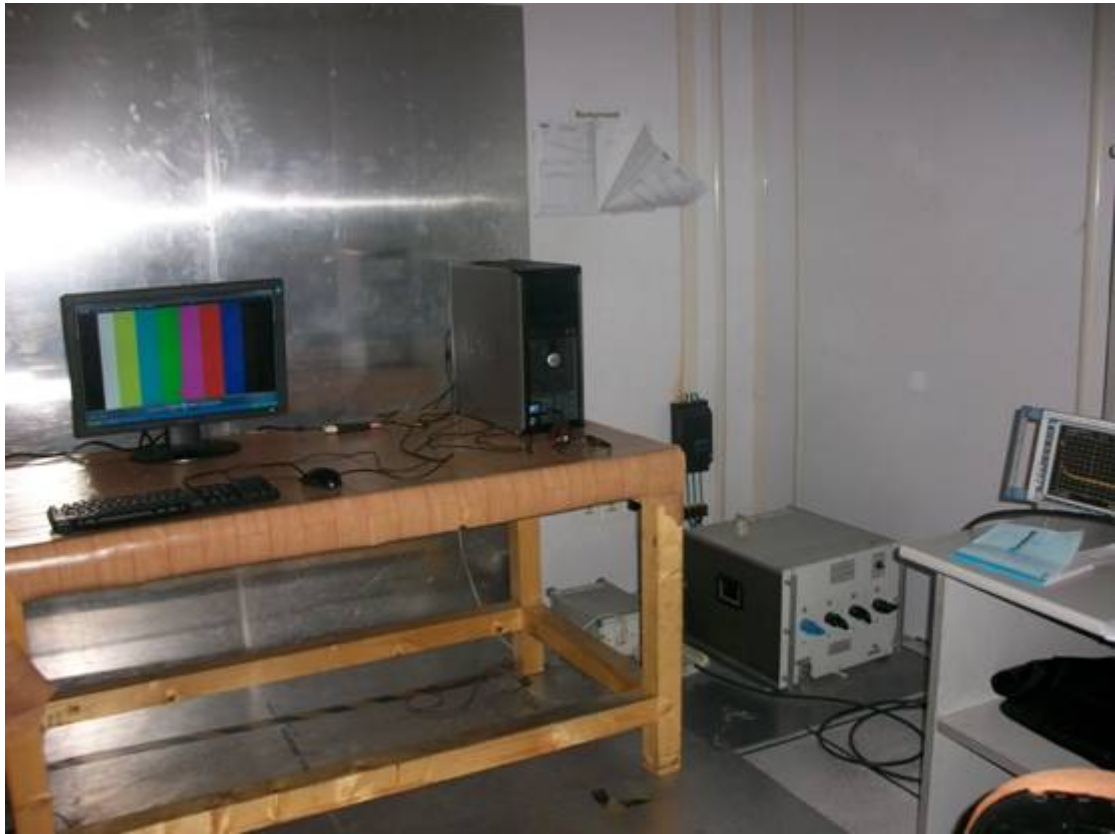
Test photo of Conducted emission