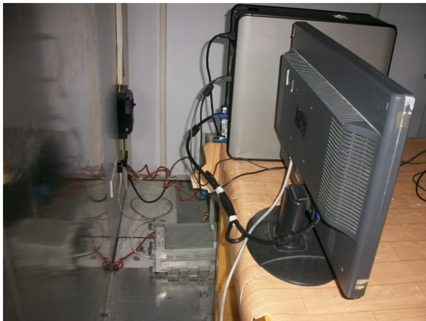
Test photo of Conducted emission