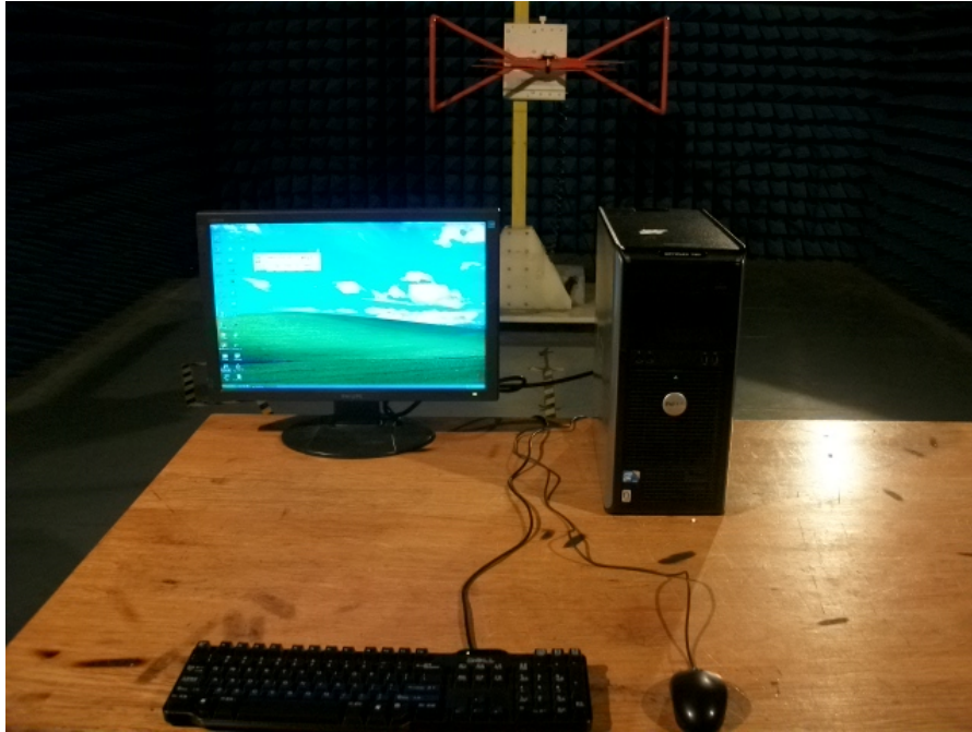
Test photo of radiated emission (30MHz-1000MHz)