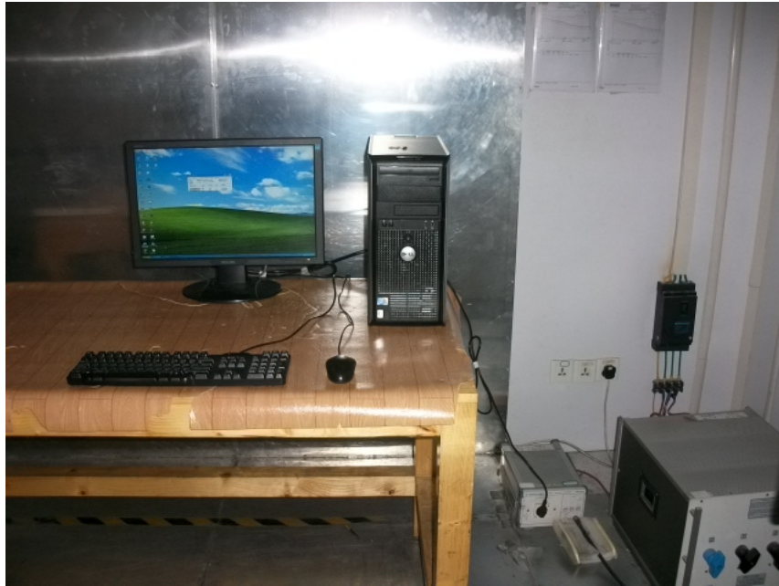
Test photo of Conducted emission