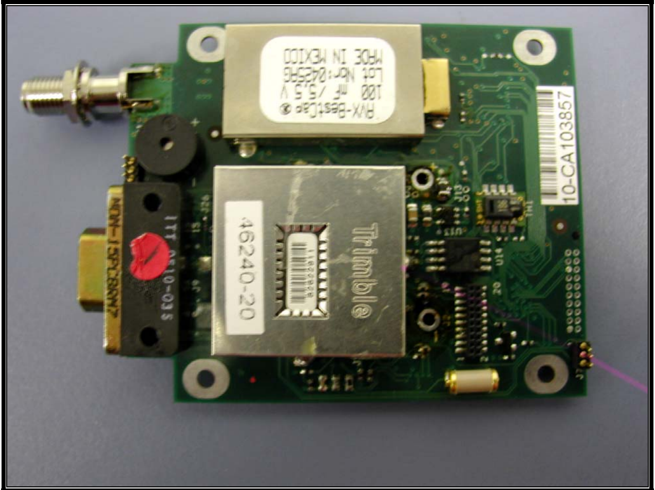
Photograph 9: PCB with Super-capacitor and Trimble Self-enclosed Component