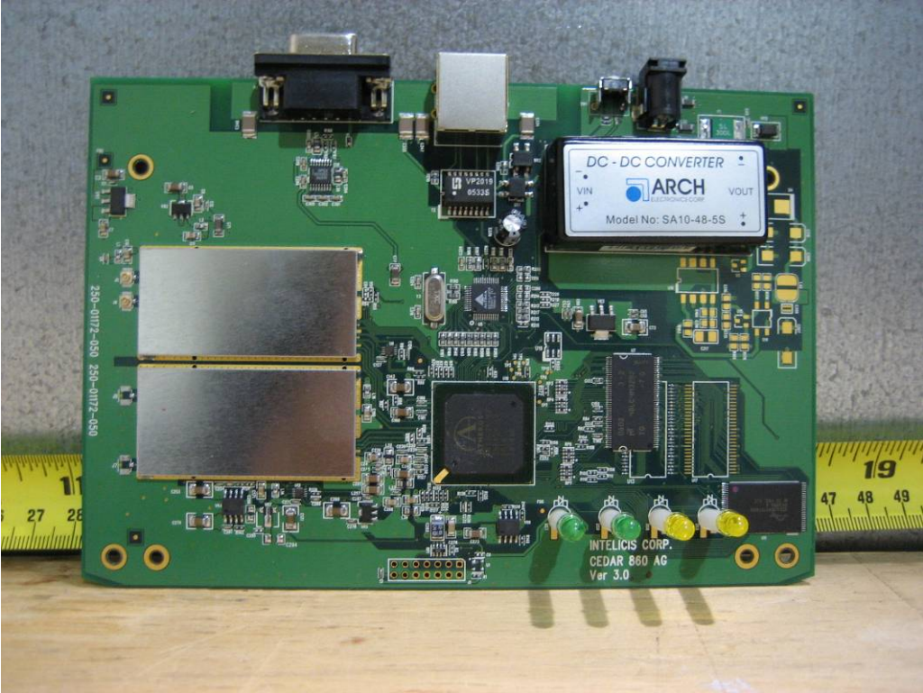
RF MAIN BOARD – TOP SIDE with SHIELD