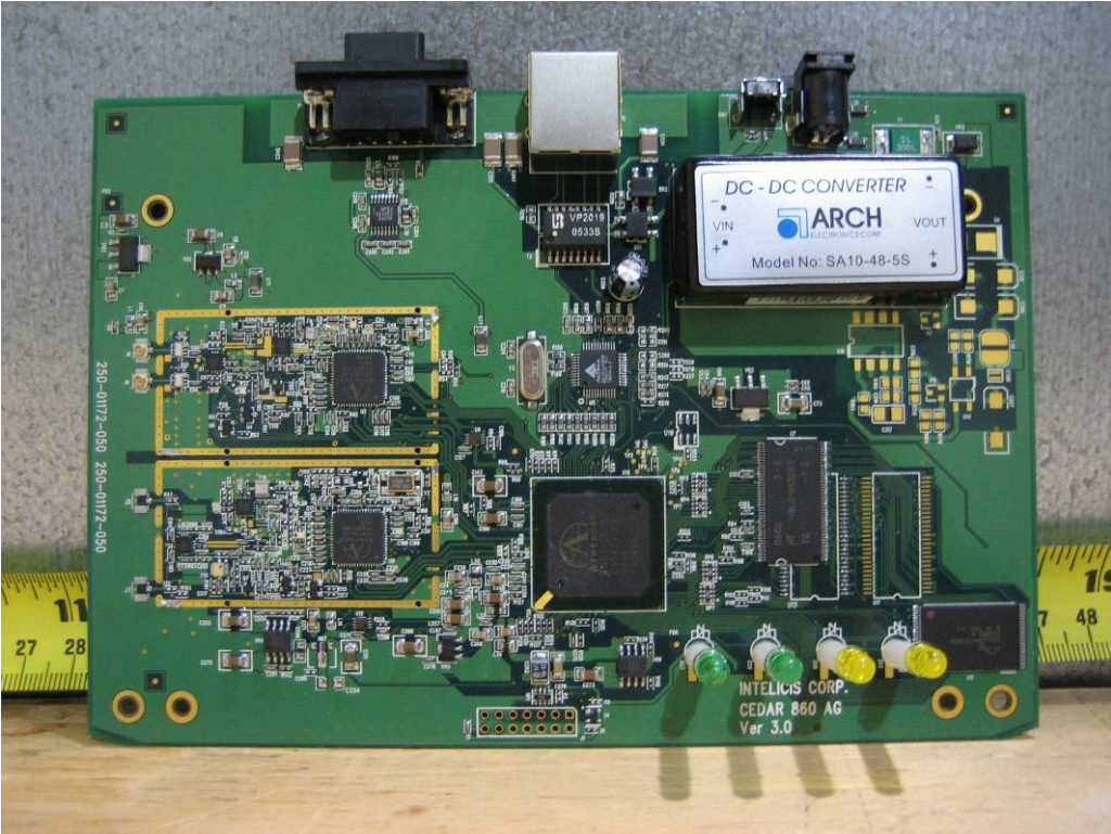
RF MAIN BOARD – TOP SIDE without SHIELD