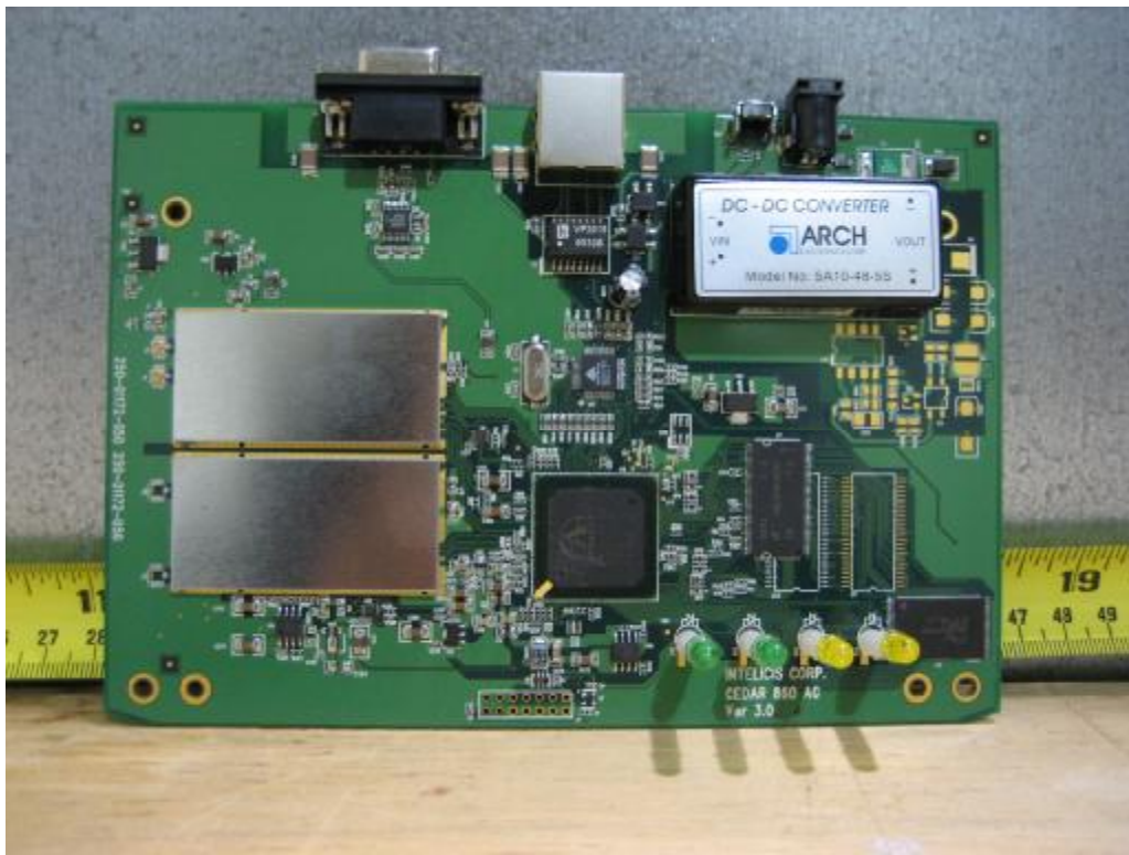
RF MAIN BOARD – TOP SIDE with SHIELD