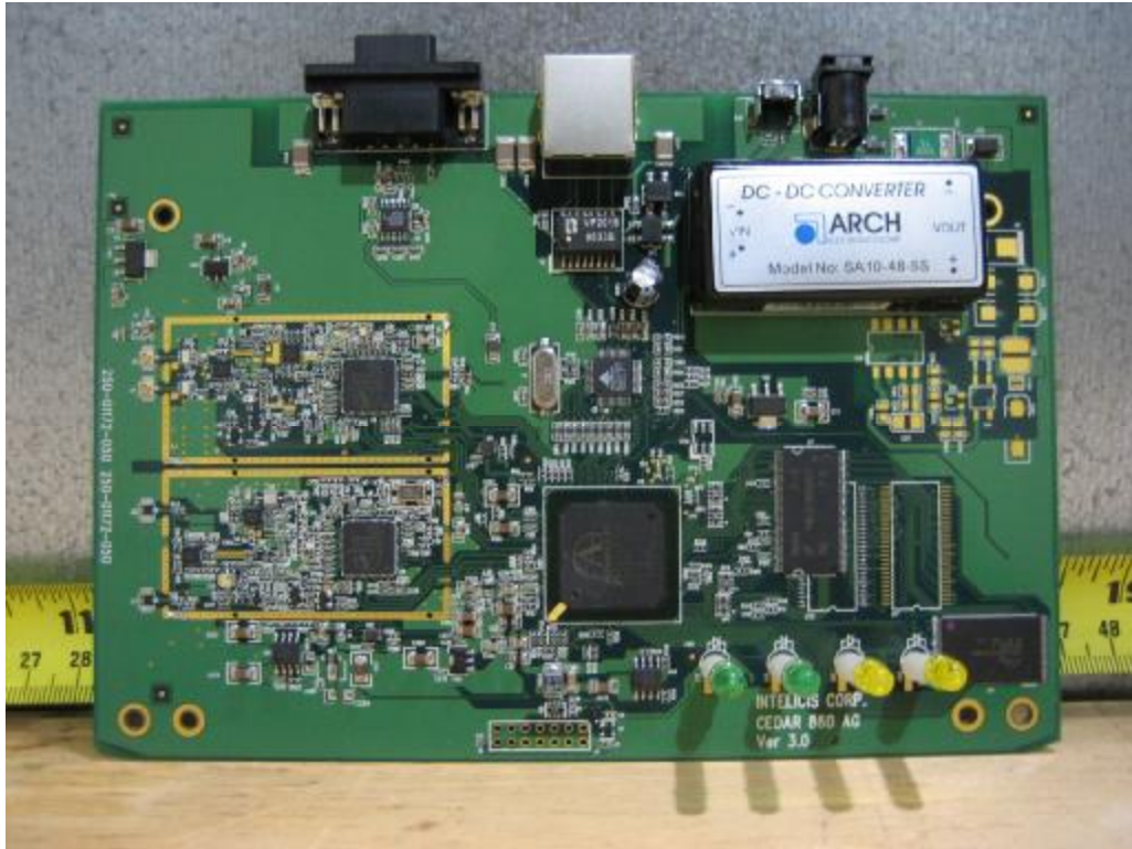
RF MAIN BOARD – TOP SIDE without SHIELD