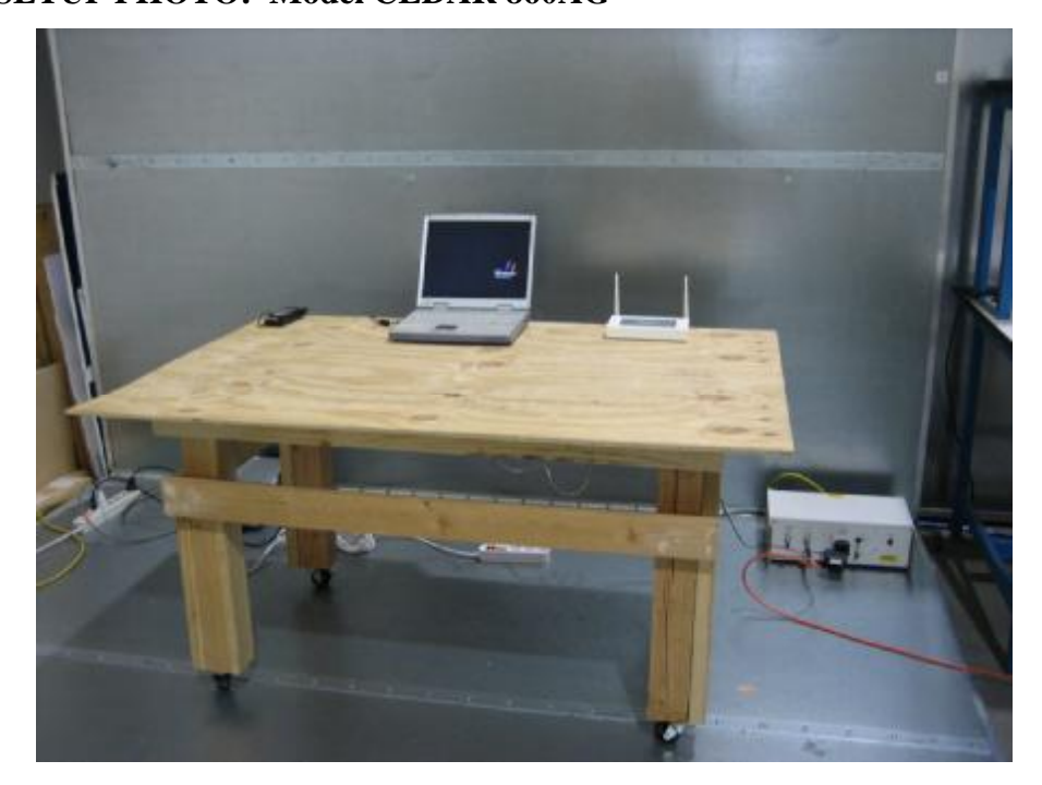
Conducted Emissions Voltage Setup