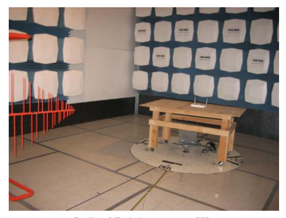
Radiated Emission setup < 1 GHz