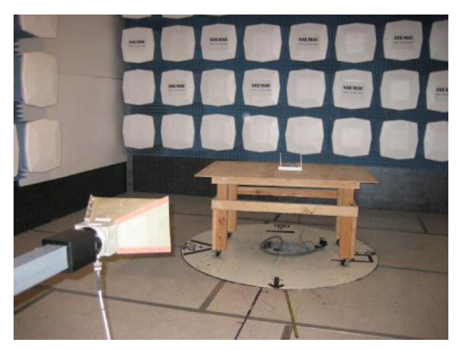
Radiated\ Emission\ setup > 1\ GHz