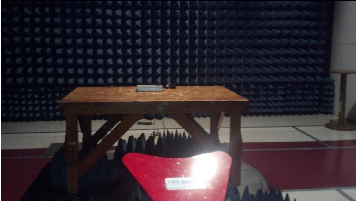
Photograph 3. Radiated Emission, Test Setup, Above 1 GHz