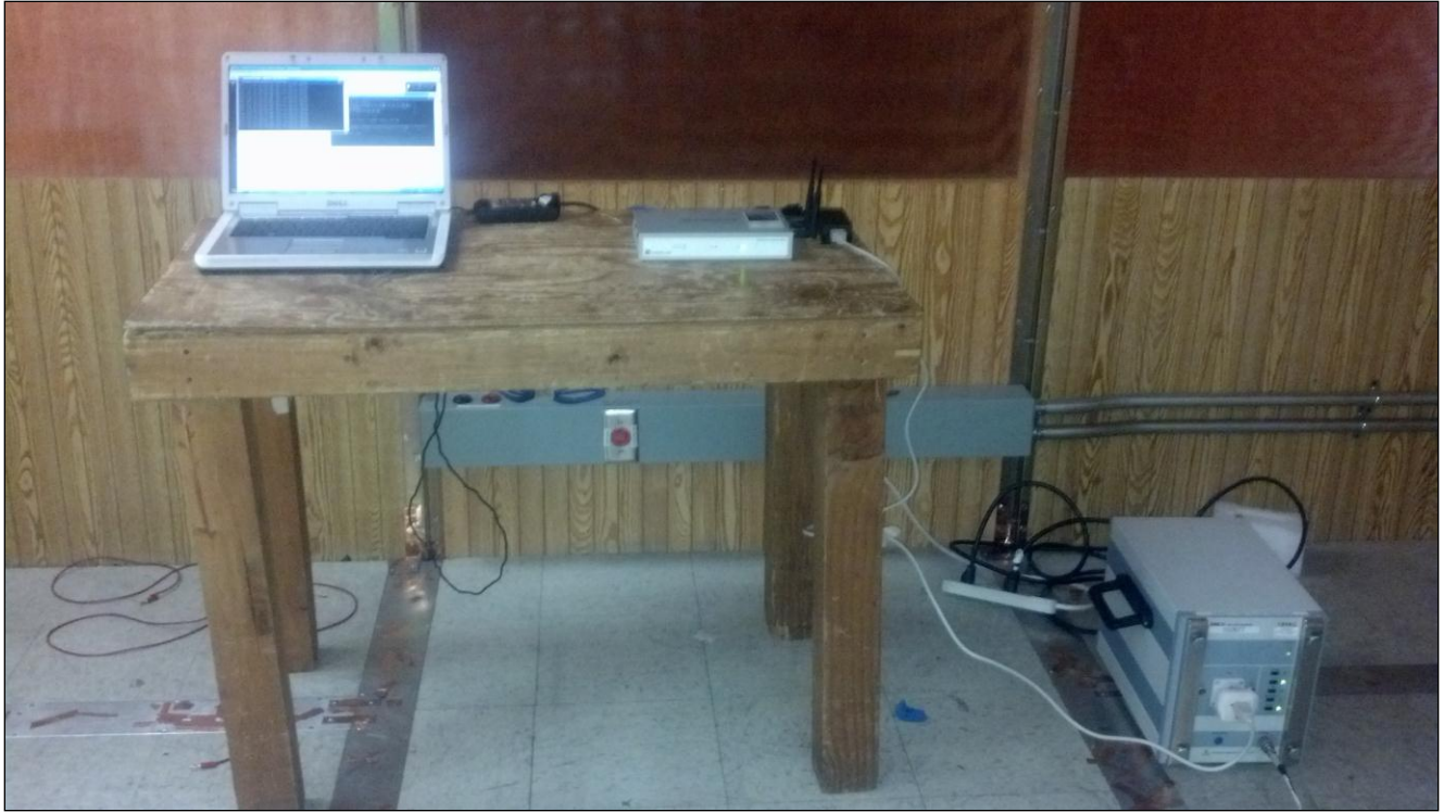
Photograph 1. Conducted Emissions, Test Setup