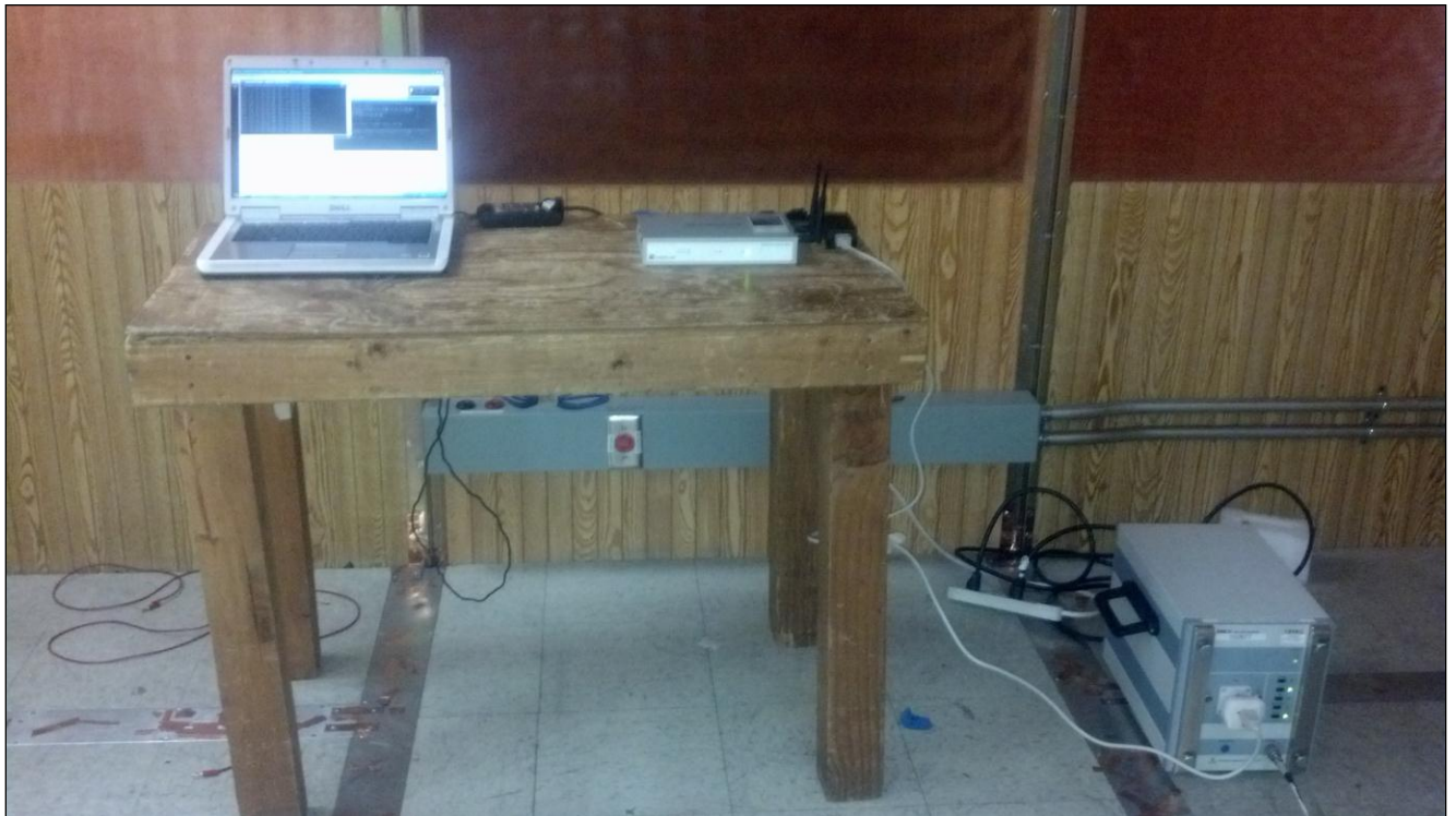
Photograph 4. Conducted Emissions, 15.207(a), Test Setup