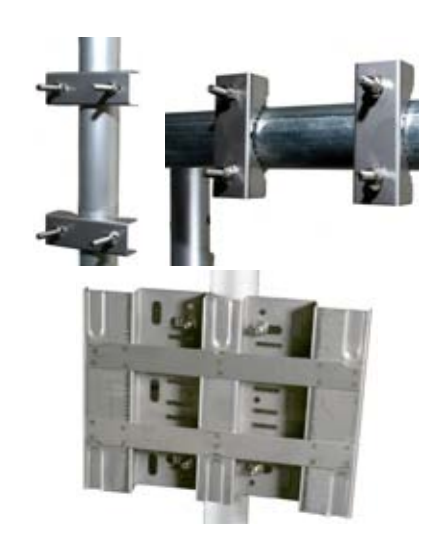
FIGURE 3.4 Mounting Examples Vertical pole and horizontal pole mounts; the universal bracket mounted to a pole.

After your radio is mounted, attach the antennas, the power cable, and any Ethernet cables you need. In Figure 3.3, note that all of the weatherproof caps have been removed from for illustrative purposes. You should not leave any unused connector uncovered.