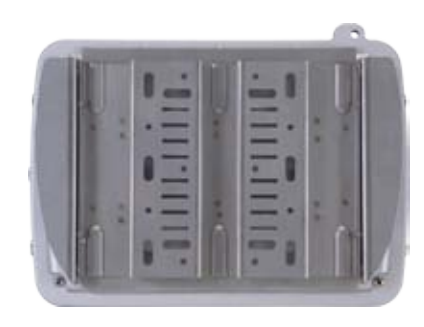
FIGURE 3.3 Mounting Bracket Your radio shipped with a two-piece mounting bracket as shown in the upper photo. To mount the radio, remove the outer piece, by loosening the thumb screws. The inner bracket can be left attached to the radio, as shown in the lower photo.