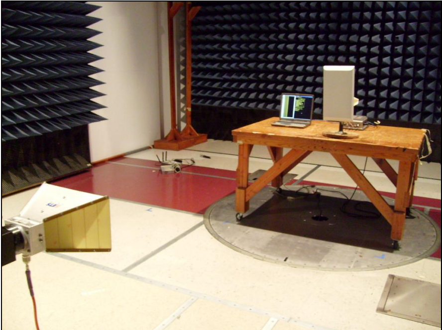
Photograph 6. Test Equipment and Setup for Various Radiated Measurements, 16 dBi Sector