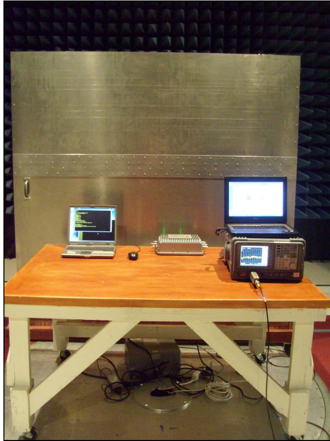
Photograph 4. Conducted Emissions, Test Setup