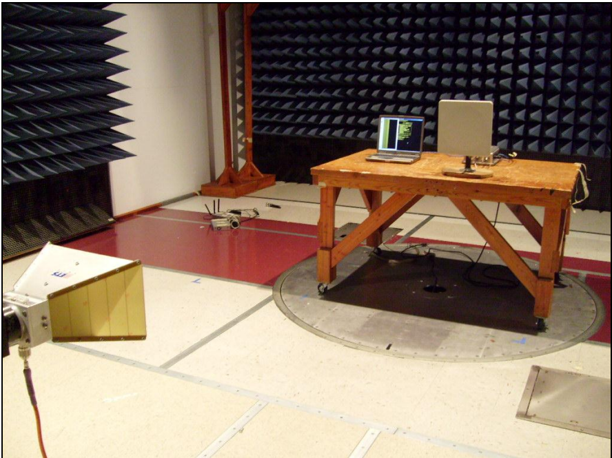
Photograph 7. Test Equipment and Setup for Various Radiated Measurements, 19 dBi Panel