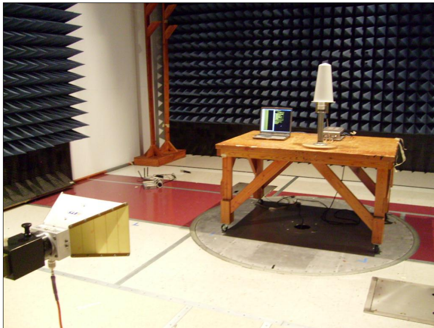
Photograph 6. Test Equipment and Setup for Various Radiated Measurements – 9 dBi Omni