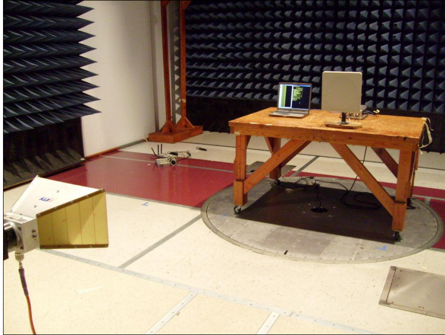
Photograph 9. Test Equipment and Setup for Various Radiated Measurements – 19 dBi Panel