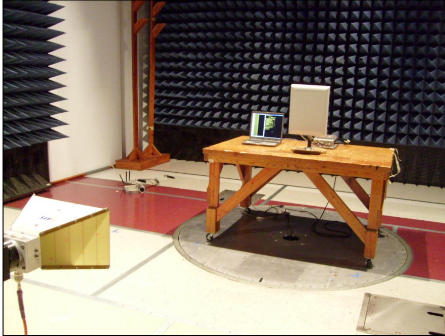
Photograph 7. Test Equipment and Setup for Various Radiated Measurements – 13 dBi Sector