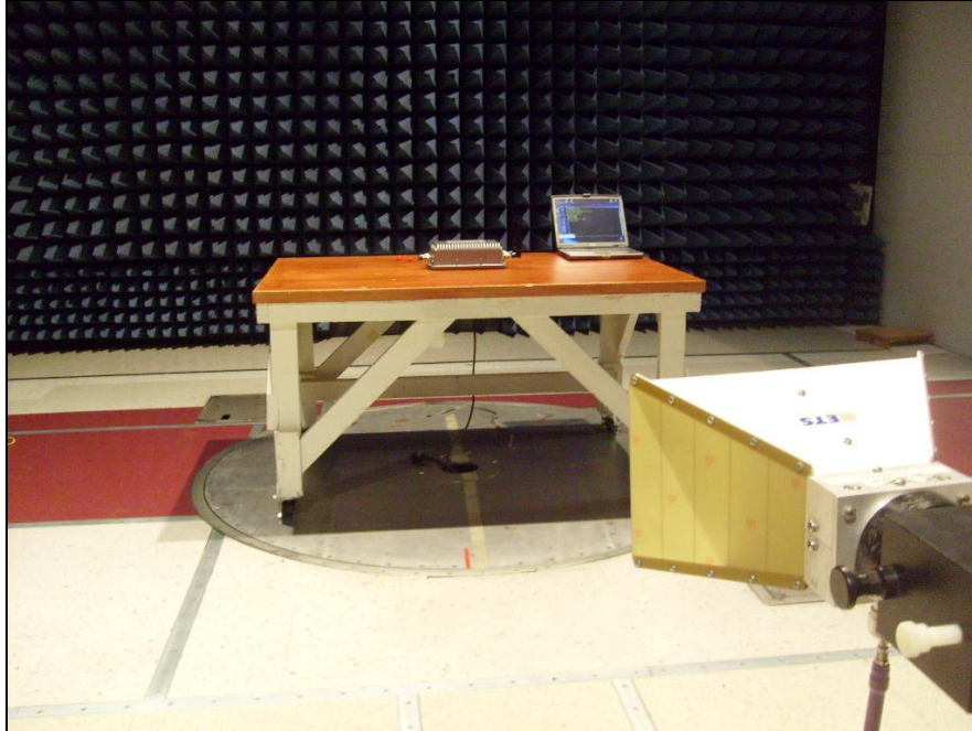
Photograph 5. Test Equipment and Setup for Various Radiated Measurements – 5 dBi Omni