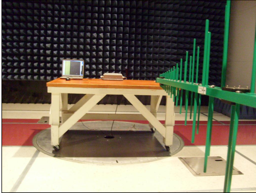
Photograph 2. Radiated Emission, Test Setup, 30 MHz – 1 GHz