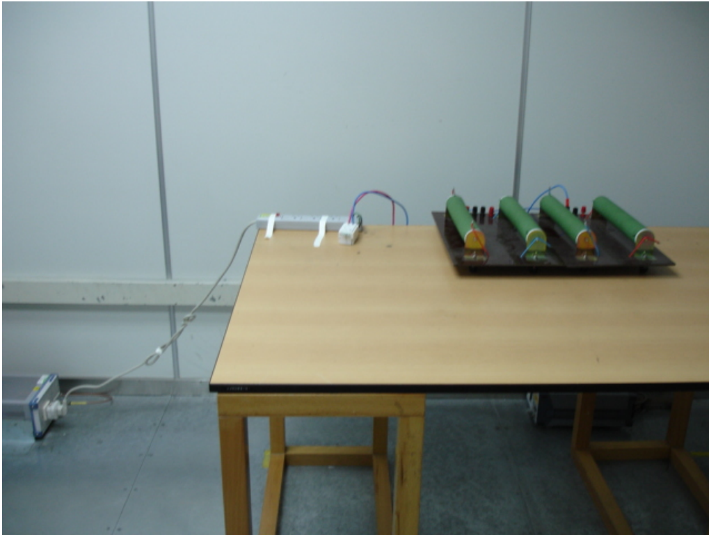
Photo 2 Conducted Emission Test