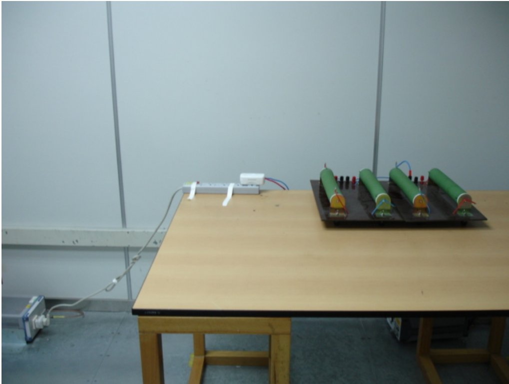
Photo 2 Conducted Emission Test