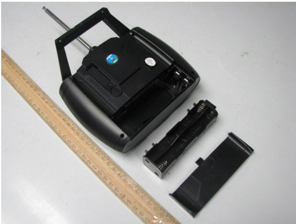
Transmitter (External view)