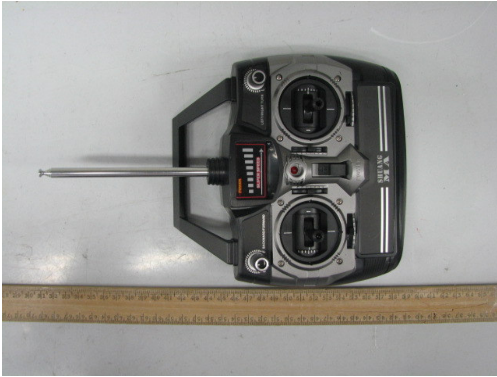
Transmitter (External view)