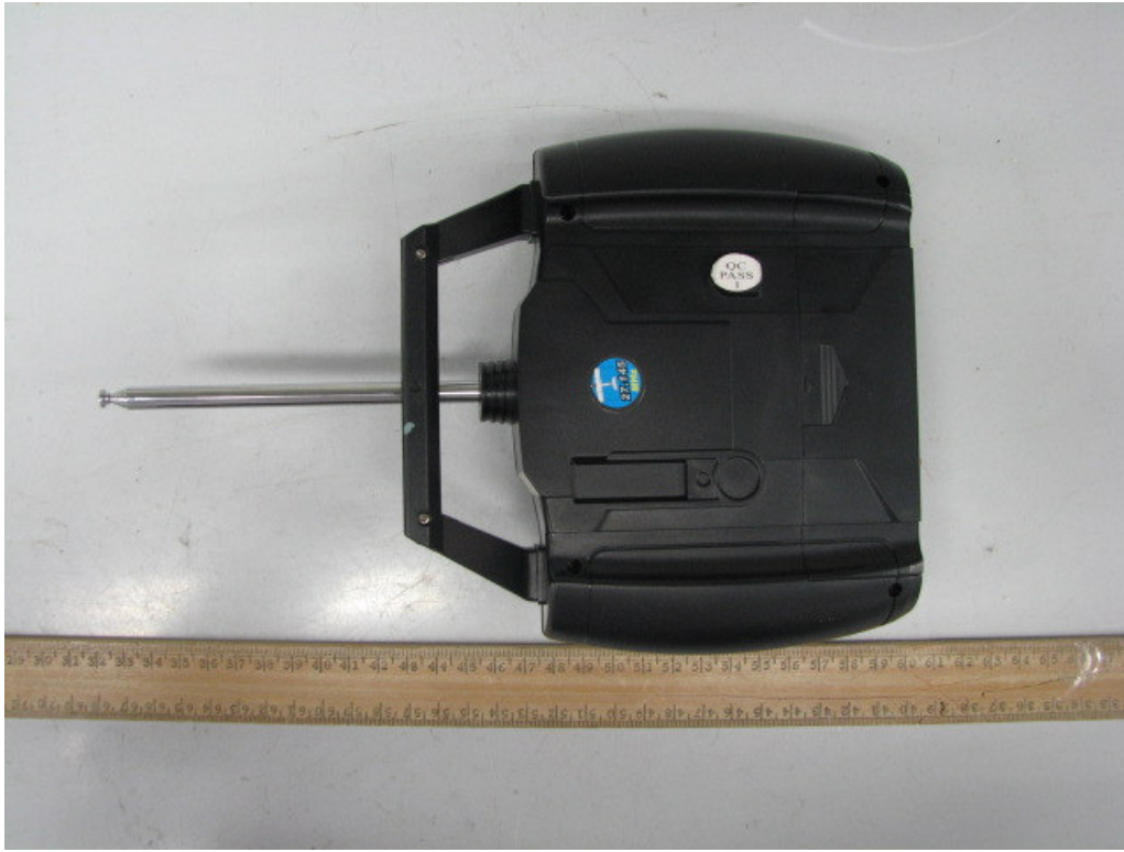
Transmitter (External view)