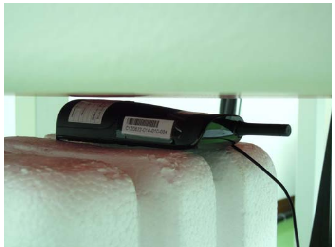
Rear Face with 1.5 cm Gap (Ant to Phantom)