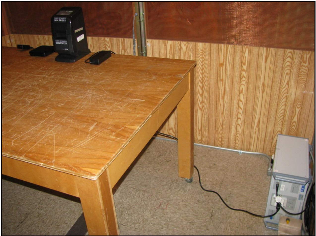
Photograph 4: Conducted Testing – Front View