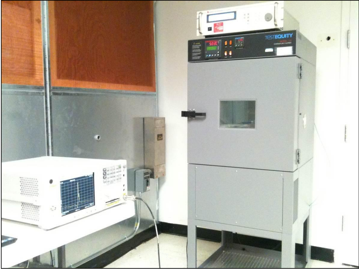
Photograph 4. Frequency Stability, Test Setup