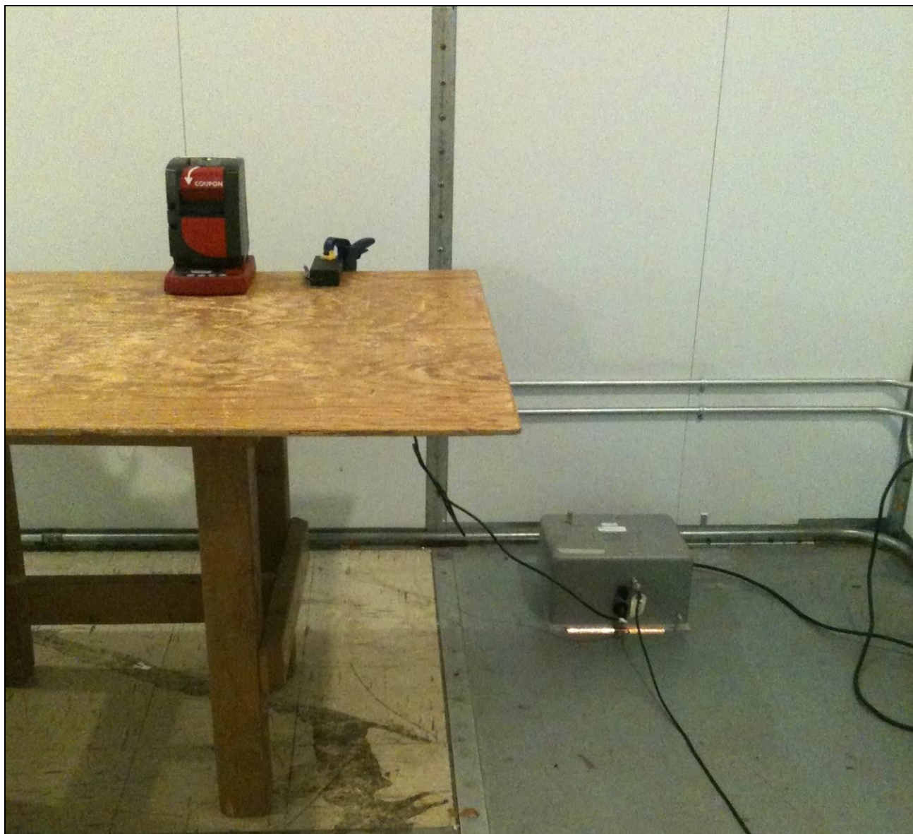
Photograph 1. Conducted Emissions, 15.207(a), Test Setup